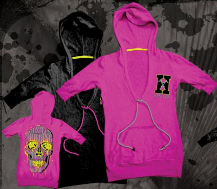
WC2001 SECOND VERSE BLACK, PINK 100% COTTON PRINTED HOODIE PULLOVER S-XL