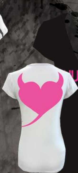
WR4022 ARCHER HEART WHITE, BLACK 95% COTTON 5% SPANDEX V-NECK FRONT & BACK S-XL