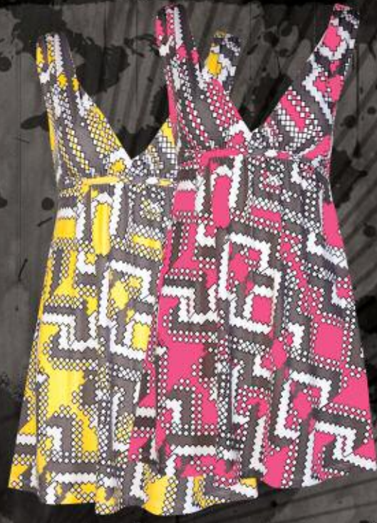
WD3010 OPTIC PINK, YELLOW 100% COTTON SLEEVELESS EMPIRE WAIST DRESS S-L