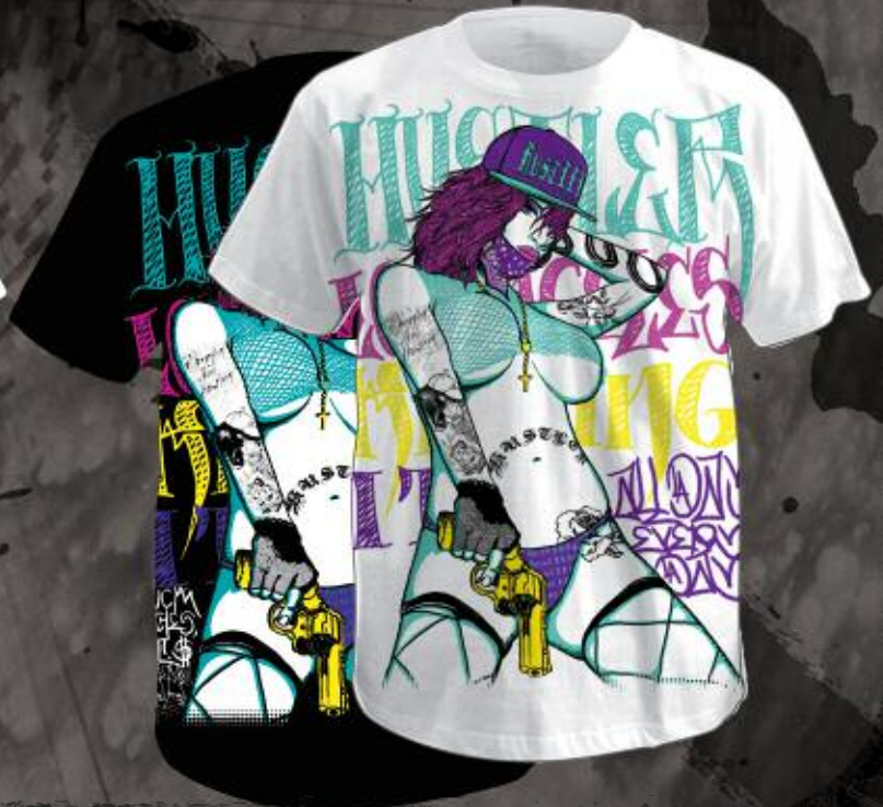
MR1278-FINA WHITE, BLACK 100% COTTON PRINTED TEE M-2XL