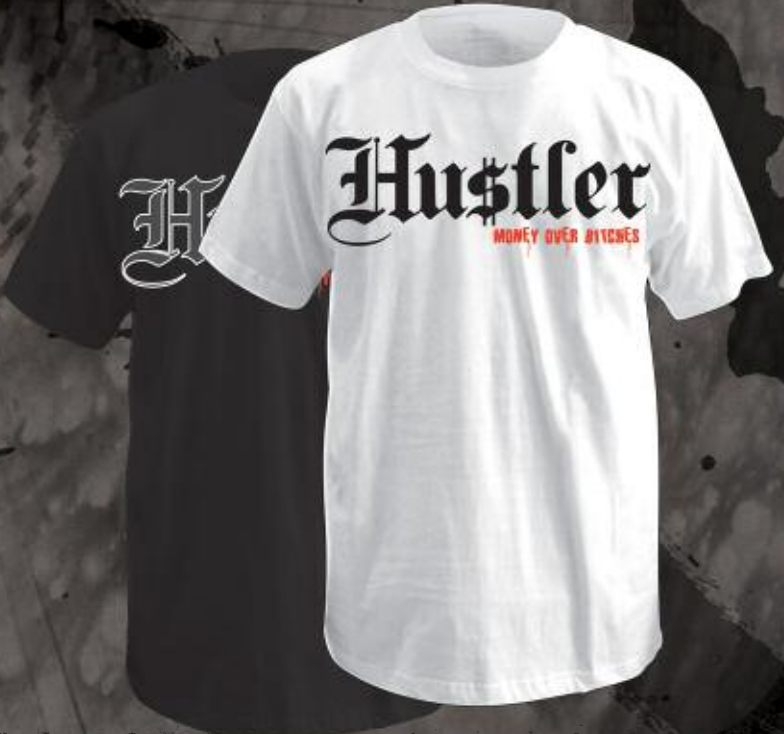
MR1293 MONEY OVER BITCHES BLACK, WHITE 100% COTTON PRINTED TEE M-2XL