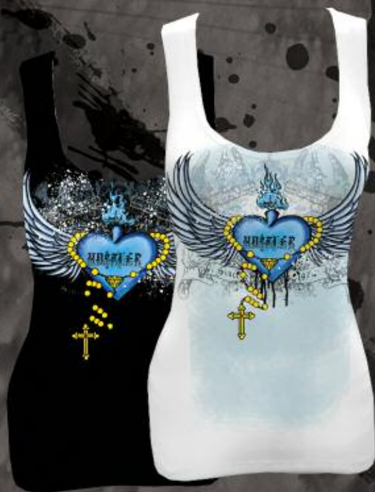
WT3078 THE BLUES WHITE, BLACK 95% COTTON 5% SPANDEX PRINTED STRETCH TANK WITH GOLD FOIL S-XL