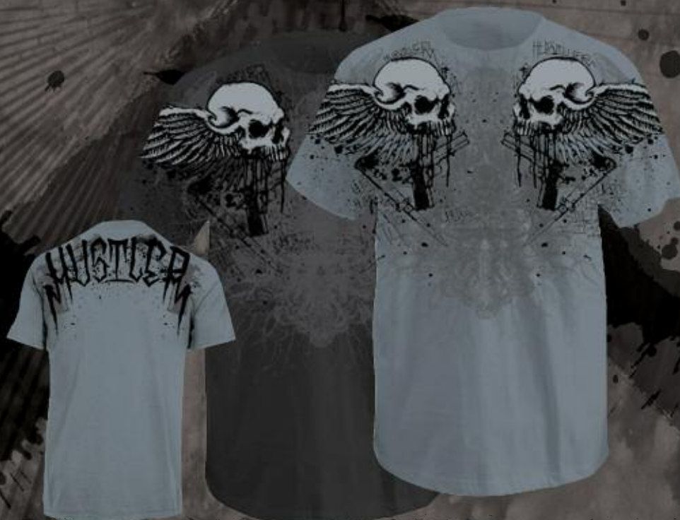
MR3024 BIG BAD HUSTLER BLACK, CHARCOAL 100% COTTON PRINTED SLIM TEE FRONT & BACK M-2XL