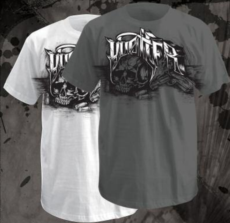
MR1266 VENGENCE WHITE, CHARCOAL 100% COTTON PRINTED TEE M-2XL