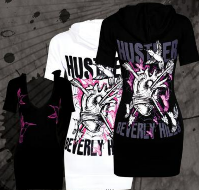
WC3010 HEARTACHE BLACK, WHITE 96% COTTON 4% SPANDEX HOODIE DRESS S-XL