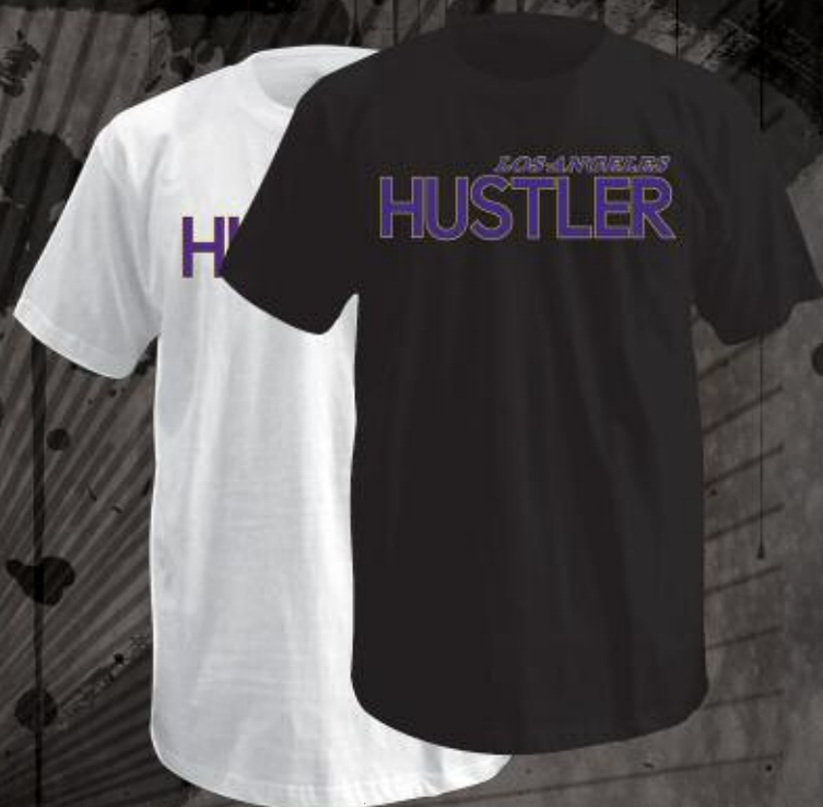
MR1281 DREAM TEAM WHITE, BLACK 100% COTTON PRINTED TEE M-2XL