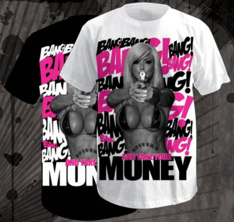
MR1251-BANG BANG BLACK, WHITE 100% COTTON PRINTED TEE M-2XL