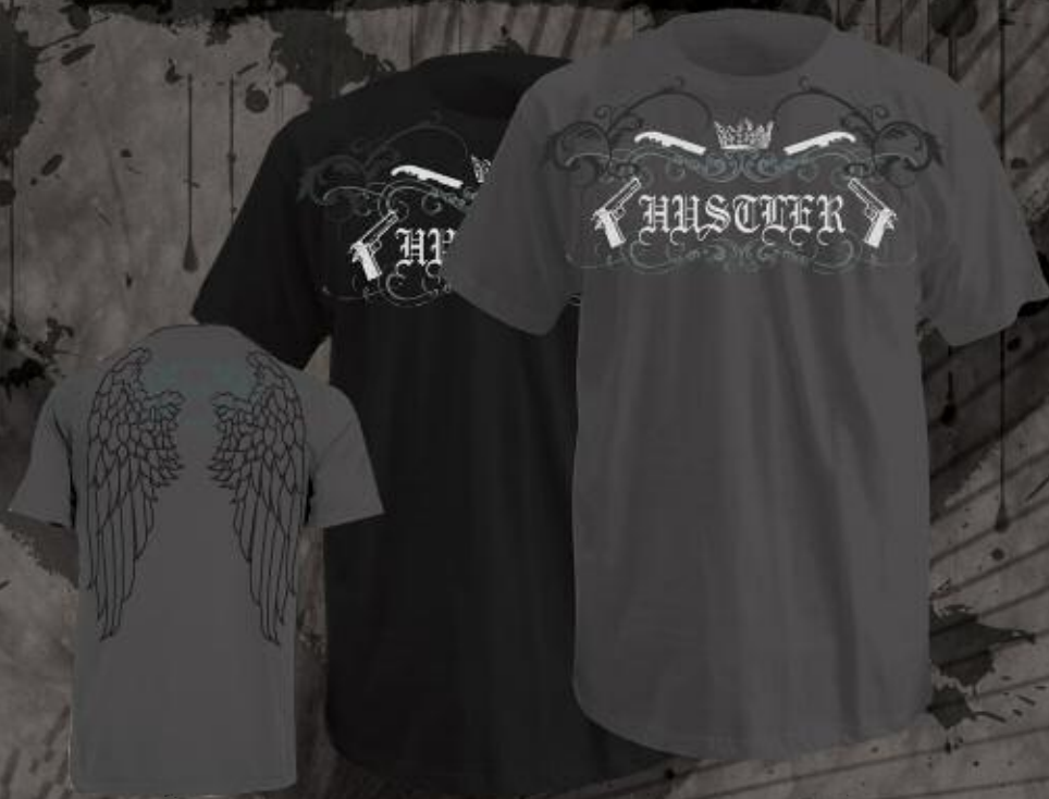
MR3023 WING SLIM BLACK, CHARCOAL 100% COTTON PRINTED SLIM TEE WITH LAZER CUT WINGS ON BACK SHOULDER M-2XL