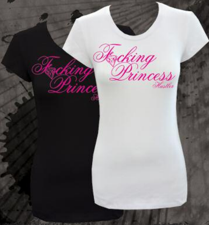
WR2133 PRINCESS 10 WHITE, BLACK 95% COTTON 5% SPANDEX PRINTED TEE S-XL