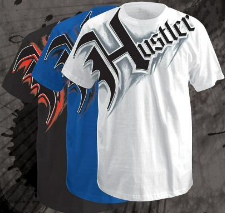
MR1292 BLAZED 10 BLACK, ROYAL, WHITE 100% COTTON PRINTED TEE M-2XL