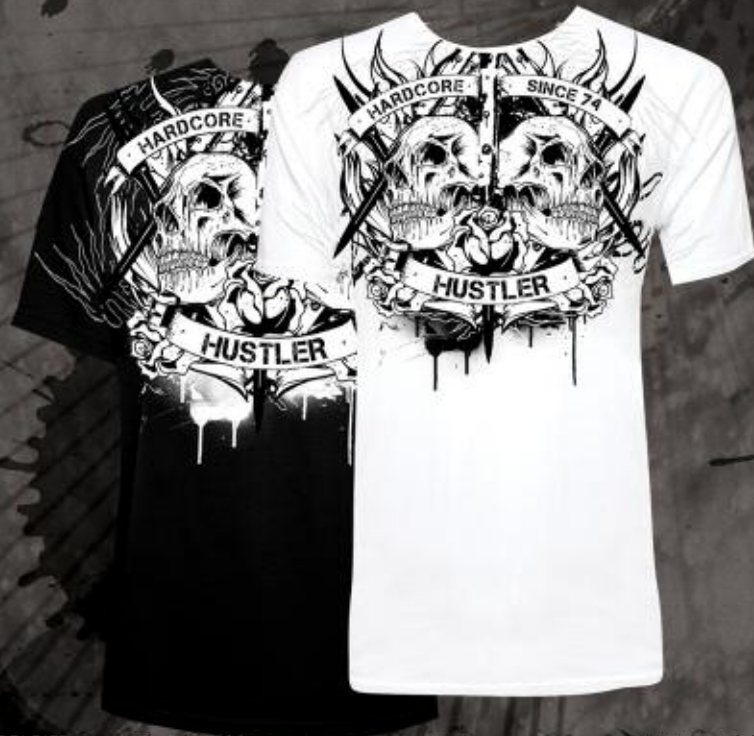
MR3002 HARD SLIM BLACK, WHITE 100% COTTON PRINTED SLIM FIT TEE M-2XL