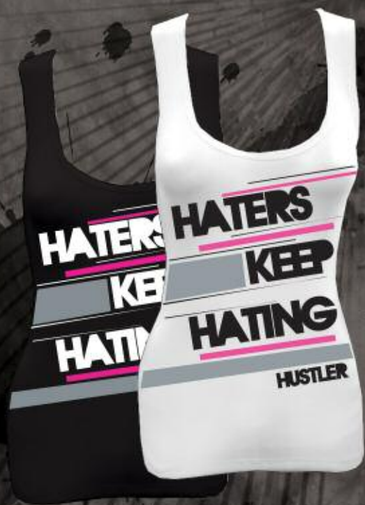
WT1058 HATER WHITE, BLACK 100% COTTON PRINTED RIBBED TANK S-XL