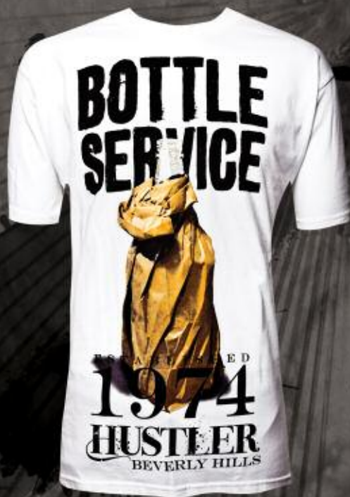
MR1240 BOTTLE SERVICE WHITE 100% COTTON PRINTED TEE M-2XL