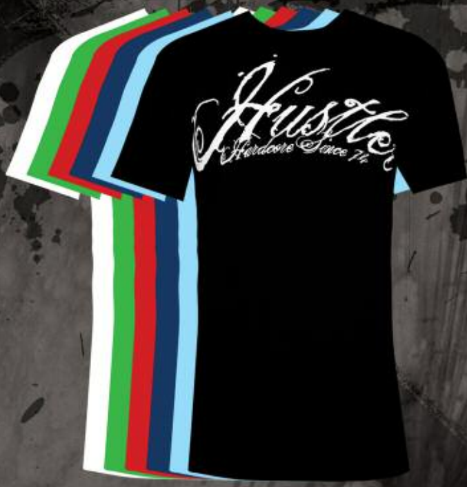
MR2002 SLIM HUSTLER BLACK, SKY BLUE, NAVY, GREEN, RED, WHITE, HEATHER GREY, BLACK/SILVER, RED/BLACK 100% COTTON PRINTED SLIM FIT TEE S-2XL