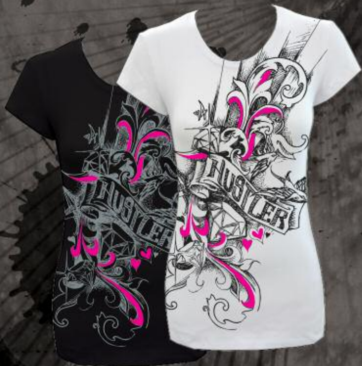
WR2161 SOUL FLY WHITE, BLACK 95% COTTON 5% SPANDEX PRINTED TEE S-XL