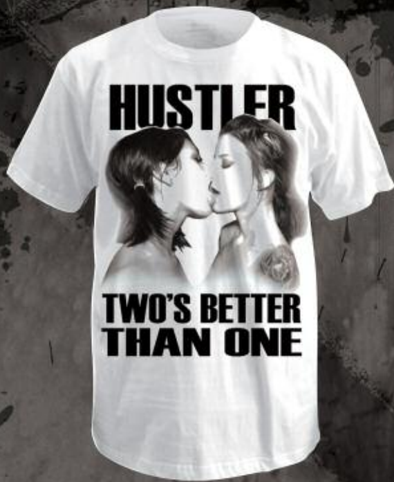
MR1255 HOOK UP WHITE 100% COTTON PRINTED TEE M-2XL