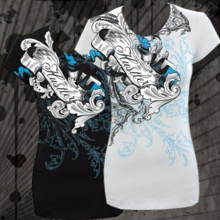
WR2164 POISON WHITE, BLACK 95% COTTON 5% SPANDEX PRINTED TEE S-XL