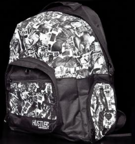
MA4001 COVERGIRL BACKPACK BLACK PRINTED & EMBROIDERED W/ POCKETS