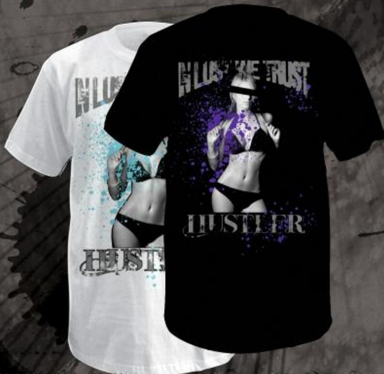
MR1261 TRUST WHITE, BLACK 100% COTTON PRINTED TEE M-2XL