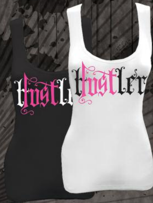
WT1062 LUST BLACK, WHITE 100% COTTON PRINTED RIBBED TANK S-XL