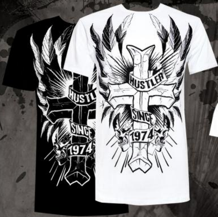
MR3000 VENICE SLIM BLACK, WHITE 100% COTTON PRINTED SLIM FIT TEE M-2XL