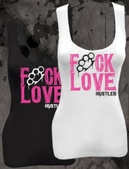
WT3082 F LOVE BLACK, WHITE 95% COTTON 5% SPANDEX PRINTED STRECH TANK S-XL