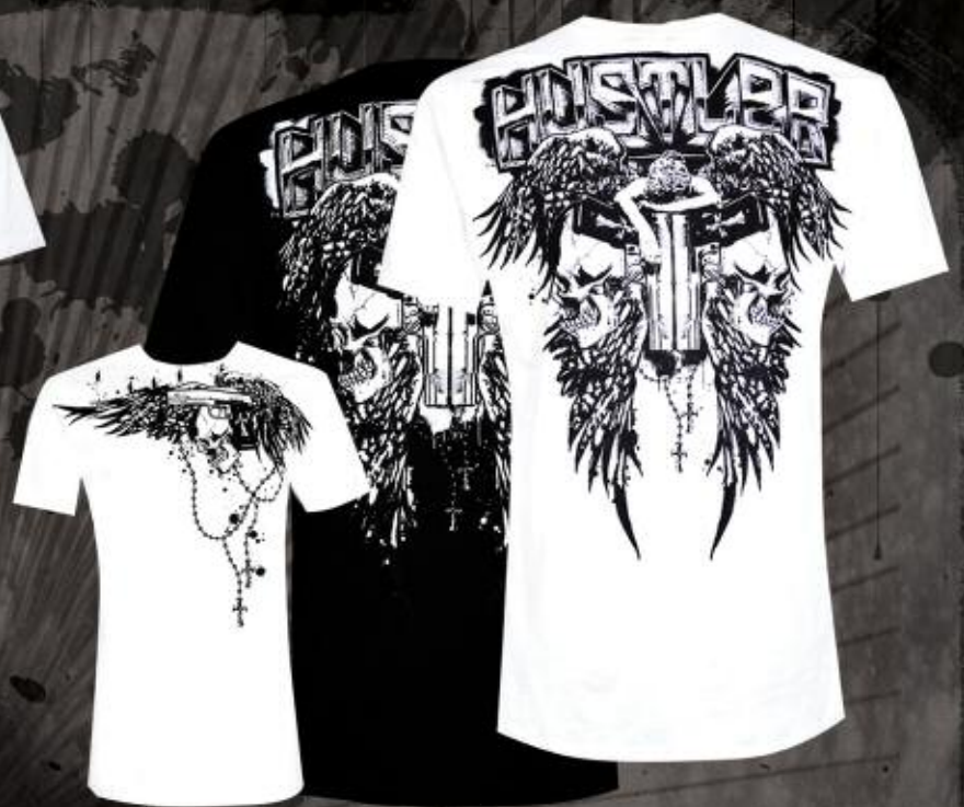
MR3001 HAND OF GOD SLIM BLACK, WHITE 100% COTTON PRINTED SLIM FIT TEE FRONT AND BACK M-2XL