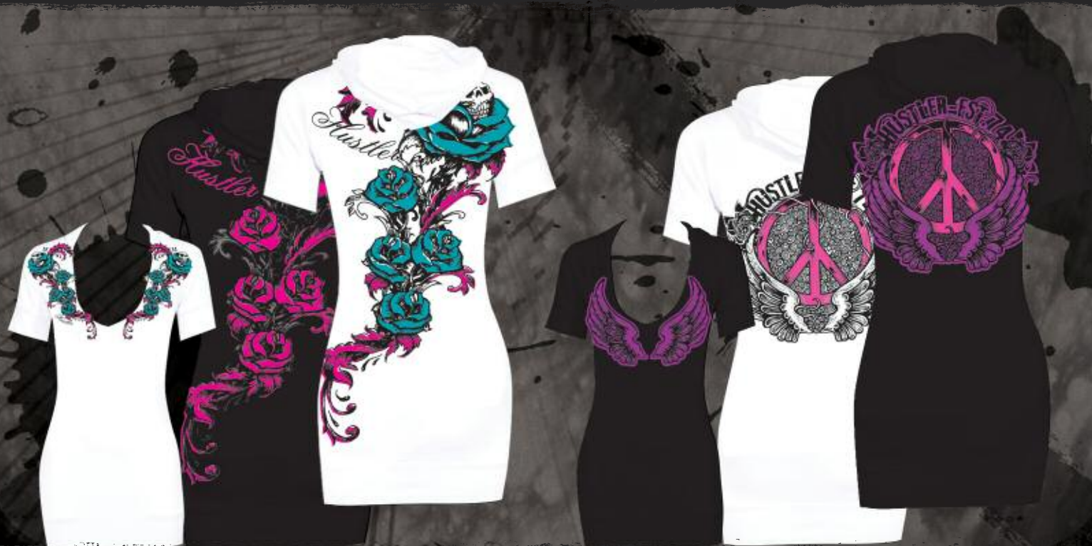
WD6004 ROSE SKULL BLACK, WHITE 95% COTTON 5% LYCRA PRINTED HOODIE DRESS S-XL