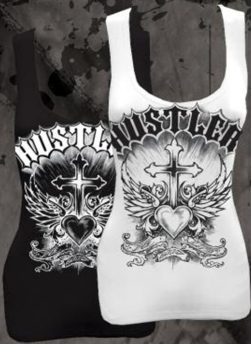
WT3077 THE GOOD LIFE BLACK, WHITE 95% COTTON 5% SPANDEX PRINTED STRECH TANK S-XL