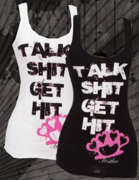
WT3043 KEEP TALKIN BLACK, WHITE 100% COTTON PRINTED RIBBED TANK S-XL