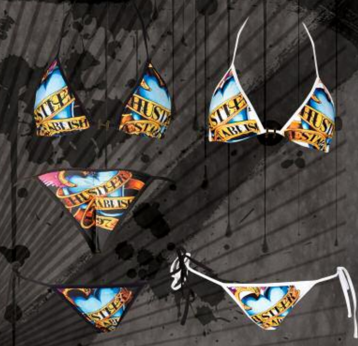
WS3006 HEART STRINGS BLACK, WHITE TRIANGLE TOP