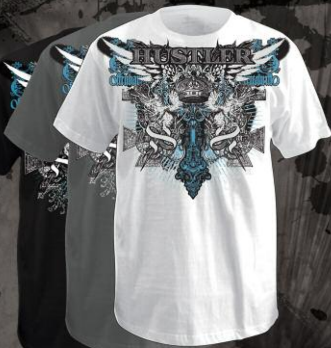
MR3009 ROYALTY SLIM WHITE, CHARCOAL, BLACK 100% COTTON PRINTED SLIM FIT TEE M-2XL