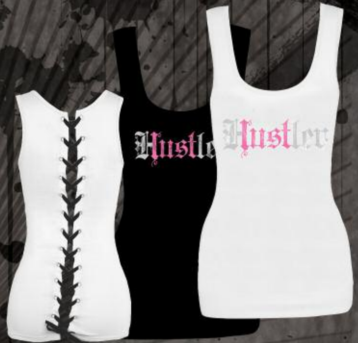
WT7002 LUST BLACK, WHITE 100% COTTON PRINTED TANK WITH LACE UP BACK S-XL