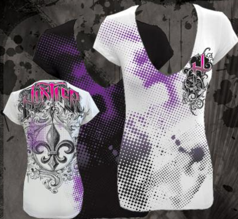
WR4028 VERTIGO WHITE, BLACK 95% COTTON 5% SPANDEX PRINTED V-NECK FRONT & BACK S-XL