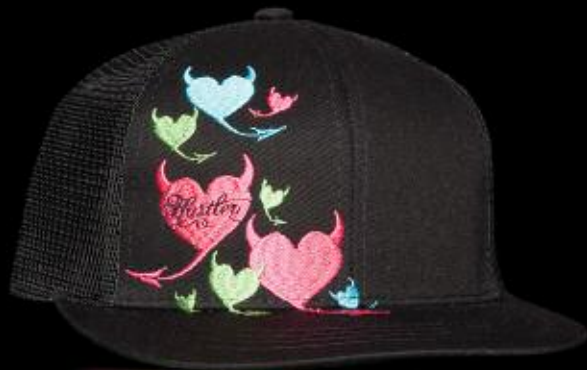
WH4009 DEVIL HEARTS TRUCKER BLACK ADJUSTABLE BACK TRUCKER