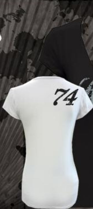
WR4026 METHOD WHITE, BLACK 95% COTTON 5% SPANDEX PRINTED V-NECK FRONT & BACK S-XL