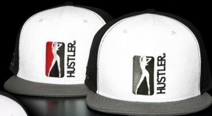
MH3036 LAP DANCE BLACK-CHARCOAL 3D EMBROIDERED FLAT BILLED HAT WITH INSIDE TAPING S,M,L