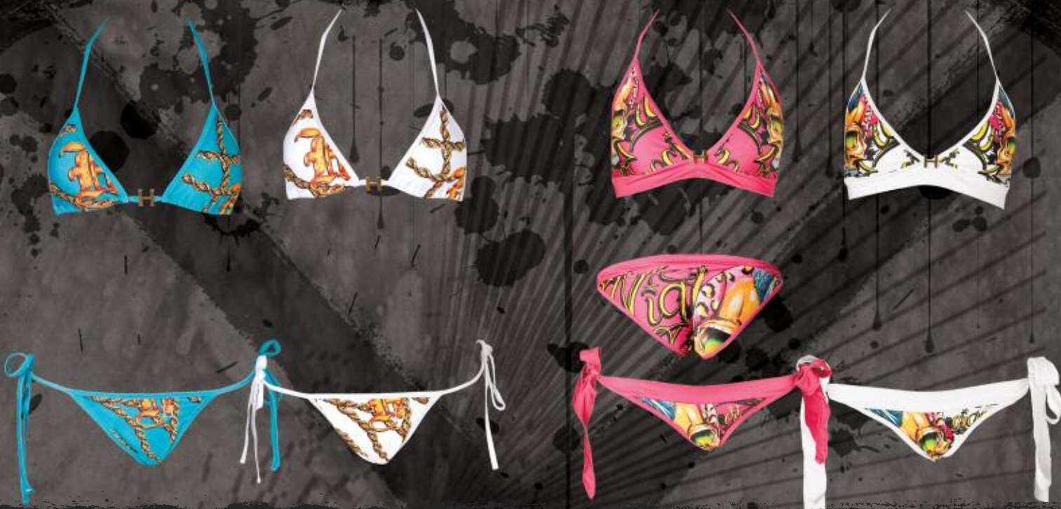
WS3007 CHAINED AQUA, WHITE TRIANGLE TOP WS4007 CHAINED AQUA, WHITE SCRUNCHY BOTTOMS