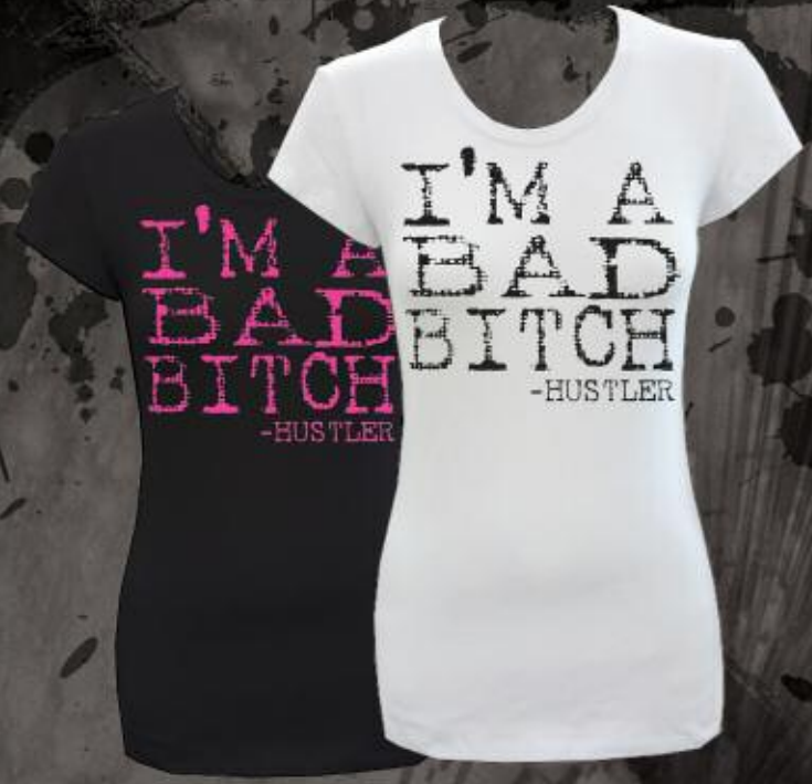
WR2160 BAD WHITE, BLACK 95% COTTON 5% SPANDEX PRINTED TEE S-XL