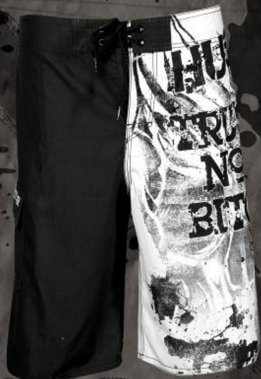
MS1011 TRUST NO BITCH BLACK