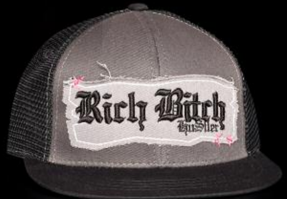
WH4008 RICH TRUCKER ADJUSTABLE BACK TRUCKER WITH APPLIQUE