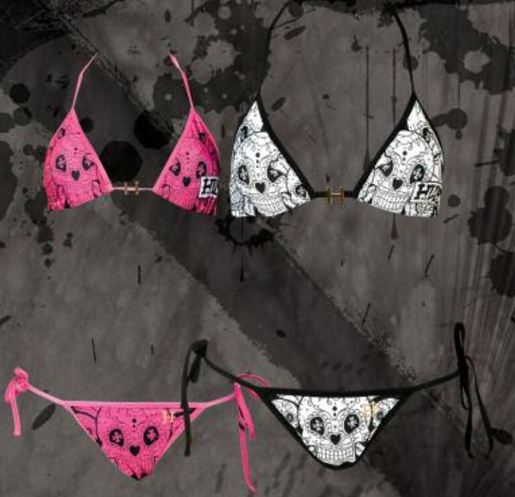
WS3005 SUGAR BLACK, PINK TRIANGLE TOP