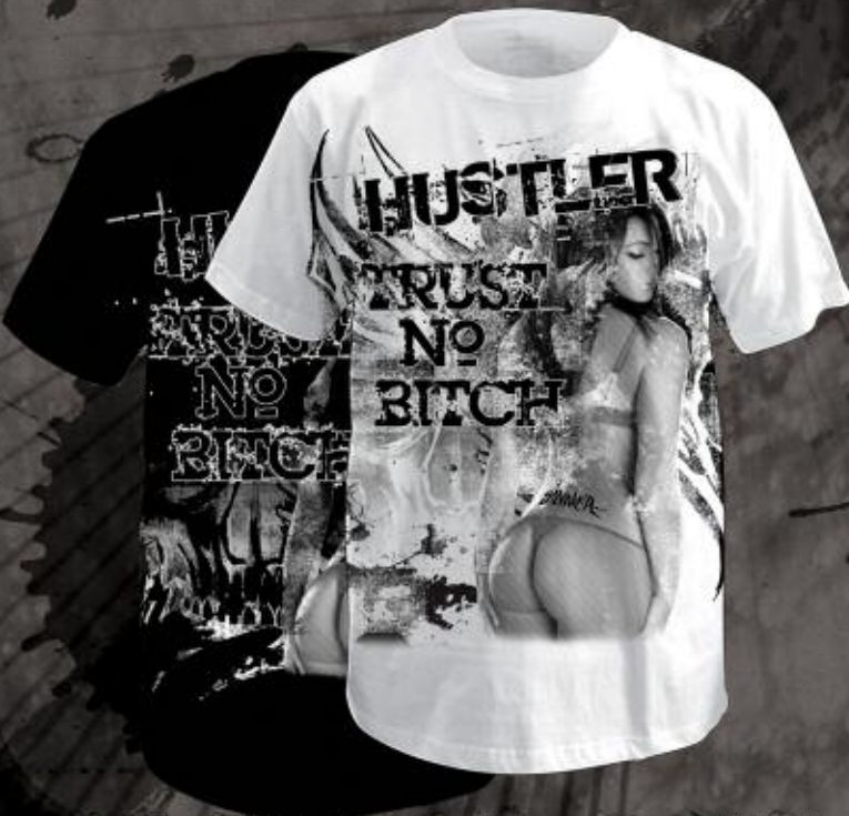
MR1253 TRUST NO BITCH BLACK, WHITE 100% COTTON PRINTED TEE M-2XL