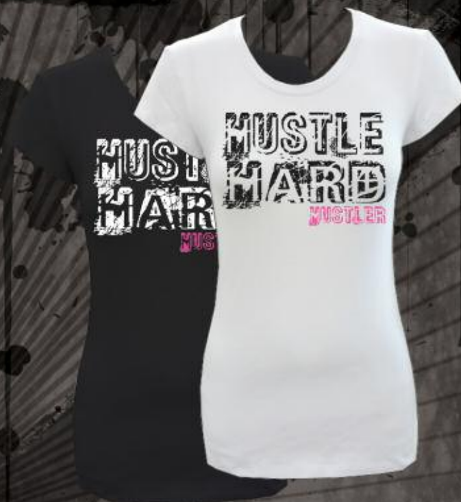
WR2168 HUSTLE HARD WHITE, BLACK 95% COTTON 5% SPANDEX PRINTED TEE S-XL