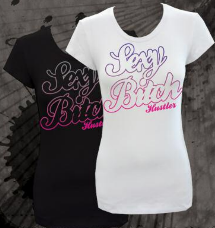
WR2137 SEXY WHITE, BLACK 95% COTTON 5% SPANDEX PRINTED TEE S-XL