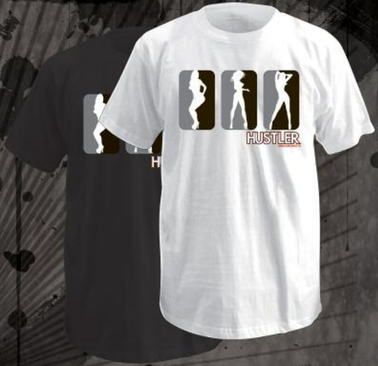
MR1291 STRIP DOWN BLACK, WHITE 100% COTTON PRINTED TEE M-2XL