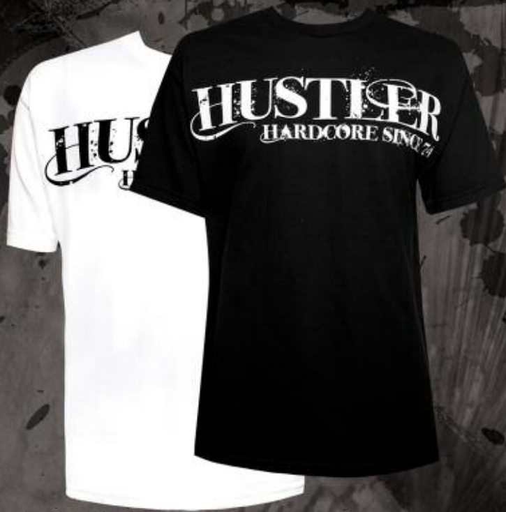
MR2001 HUSTLER CLASSIC BLACK, WHITE 100% COTTON PRINTED TEE M-2XL