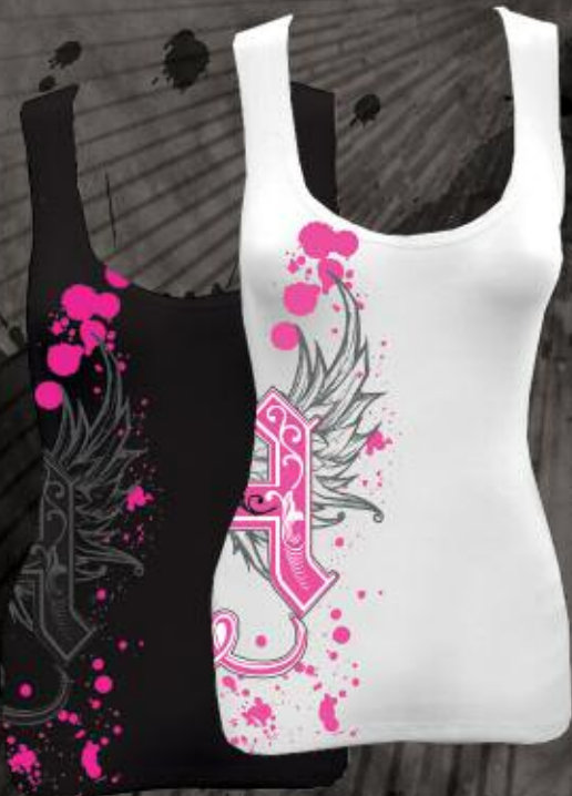
WT3070 SIDWAYS BLACK, WHITE 95% COTTON 5% SPANDEX PRINTED STRECH TANK S-XL