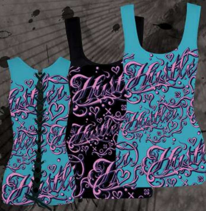
WT7001 XOXO BLACK, TEAL 100% COTTON PRINTED TANK WITH LACE UP BACK S-XL