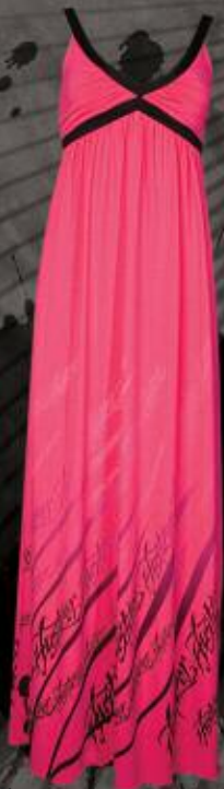
WD3002 RELAX MAXI DRESS PINK 98% COTTON, 2% LYCRA PRINTED DRESS S-L