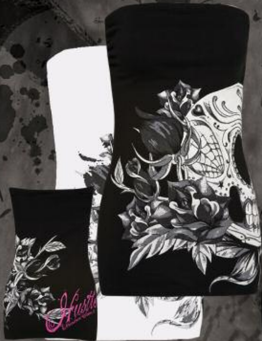
WC3006 SINISTER BLACK, WHITE PRINTED TUBE TOP 95% COTTON 5% LYCRA WITH BUILT IN SUPPORT S-L