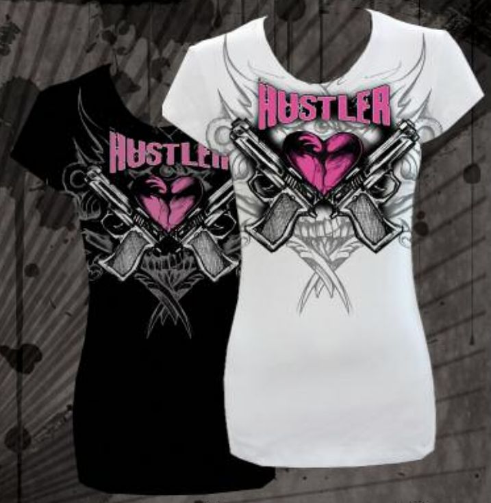
WR2162 BROKEN PROMISE WHITE, BLACK 95% COTTON 5% SPANDEX PRINTED TEE S-XL