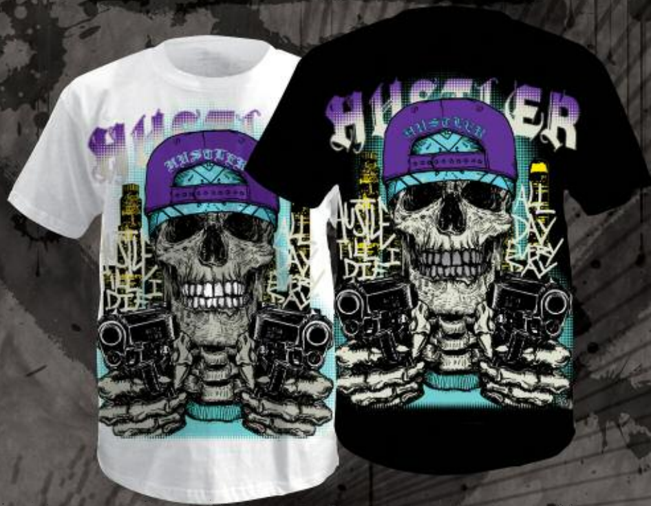
MR3017 LOKO SLIM BLACK, WHITE 100% COTTON PRINTED SLIM FIT TEE W/ SILVER FOIL M-2XL