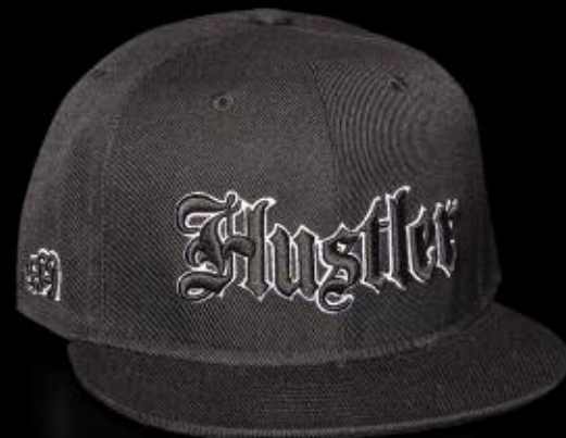
MH3019 OG BLACK 3D EMBROIDERED FLAT BILLED HAT WITH INSIDE TAPING S,M,L