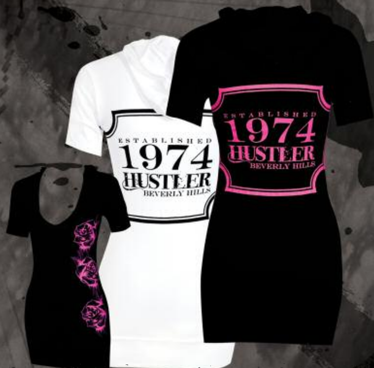
WC3009 B-HILLS BLACK, WHITE 96% COTTON 4% SPANDEX HOODIE DRESS S-XL