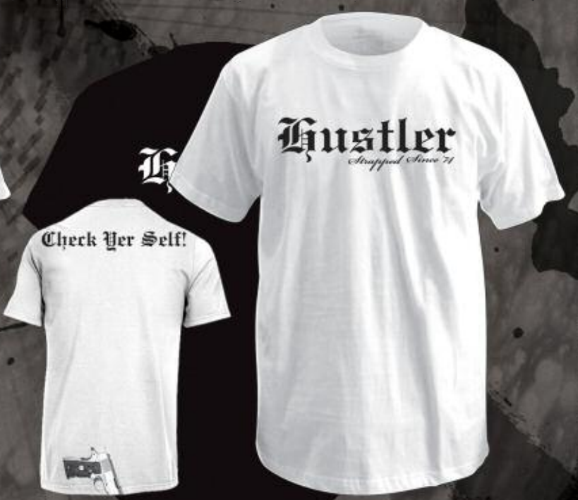
MR1260 STRAPPED BLACK, WHITE 100% COTTON PRINTED TEE FRONT & BACK M-2XL