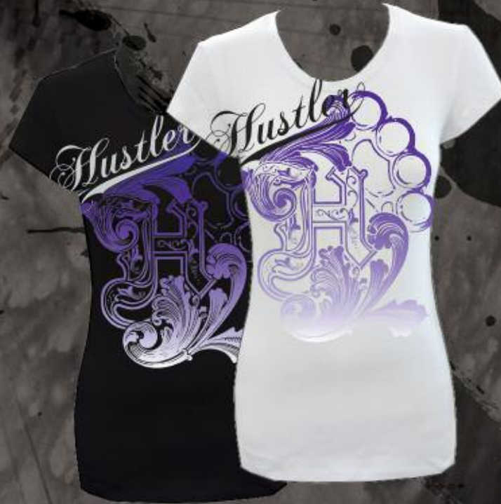
WR2134 BRASS KNUCKLES WHITE, BLACK 95% COTTON 5% SPANDEX PRINTED TEE S-XL