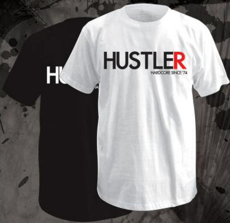
MR1262 RATED-R WHITE, BLACK 100% COTTON PRINTED TEE M-2XL