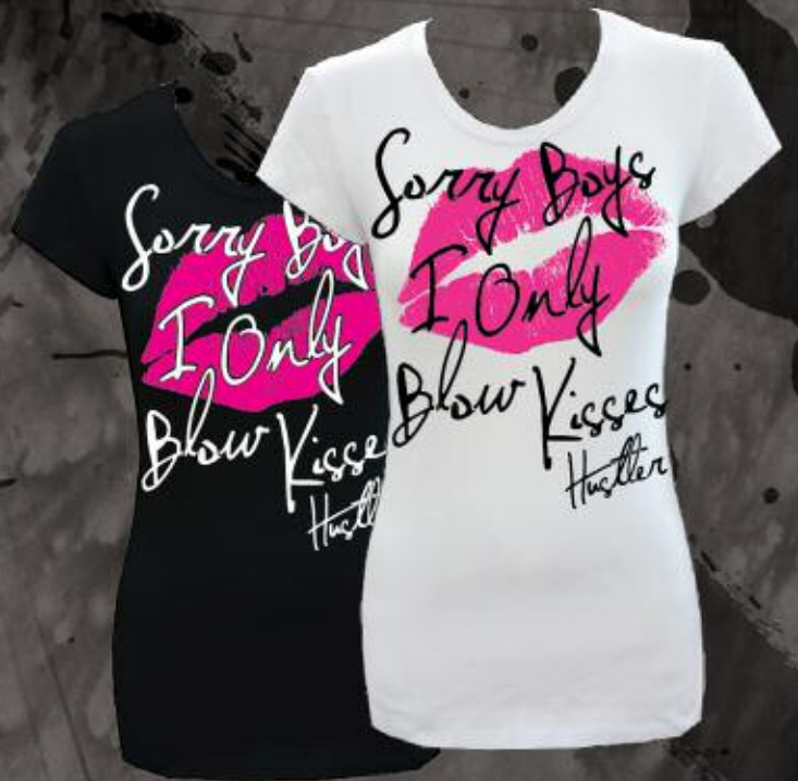
WR2124 KISSES WHITE, BLACK 95% COTTON 5% SPANDEX PRINTED TEE S-XL