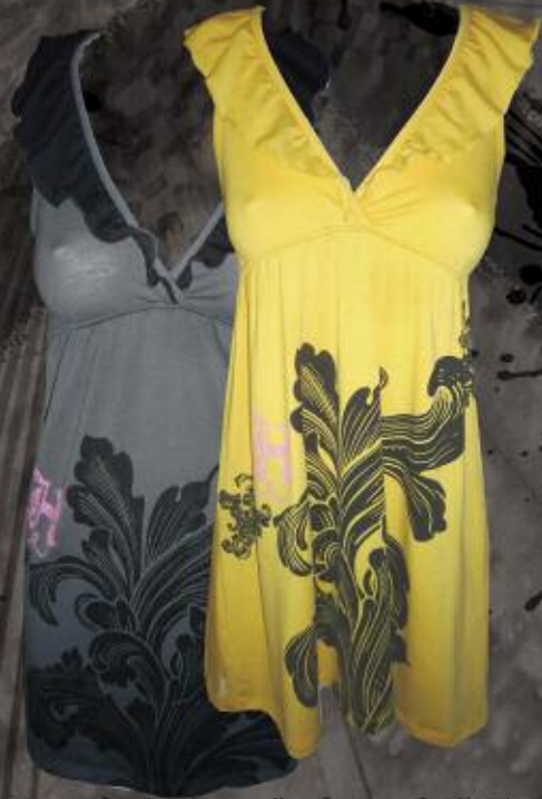
WD3005 HUSTLE N' FLOW RUFFLE DRESS YELLOW, GREY 100% COTTON EMPIRE WAIST WITH RUFFLE DETAIL S-L