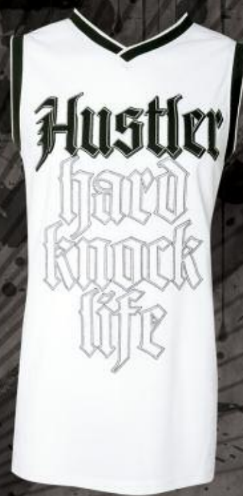
MP1005 HARD KNOCK LIFE JERSEY WHITE 100% POLYESTER M-2XL