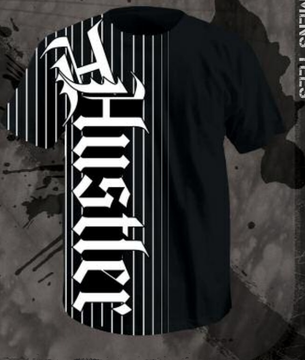
MR1288 INDO BLACK 100% COTTON PRINTED TEE M-2XL