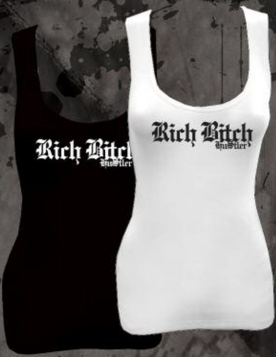
WT3083 RICH BITCH BLACK, WHITE 95% COTTON 5% SPANDEX PRINTED STRETCH TANK WITH RHINESTONE DETAIL S-XL