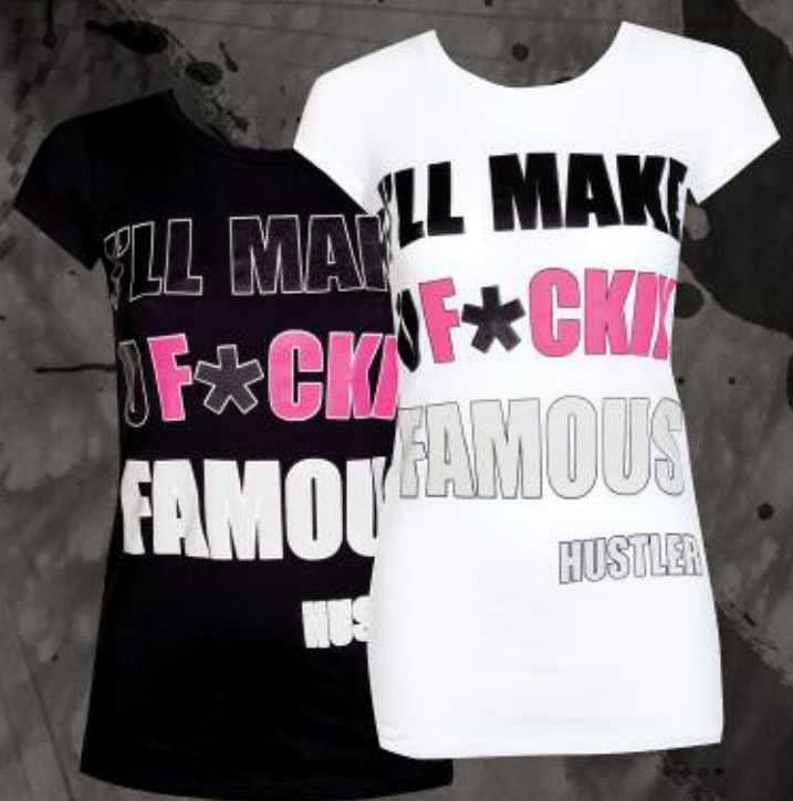
WR2117 SUPER STAR BLACK, WHITE 100% COTTON PRINTED TEE S-XL