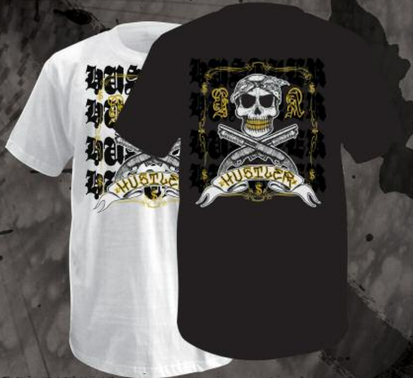
MR3029 HIT EM UP SLIM BLACK, WHITE 100% COTTON PRINTED SLIM FIT TEE M-2XL