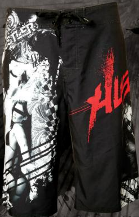
MS1013 COVERGIRL2 BLACK