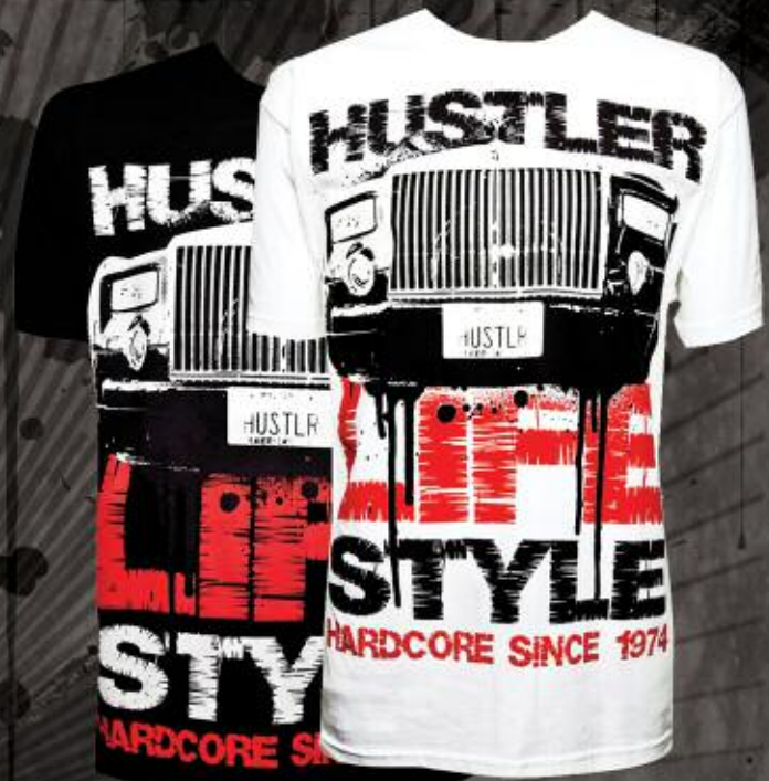
MR1234 A LIFE BLACK, WHITE 100% COTTON PRINTED TEE M-2XL