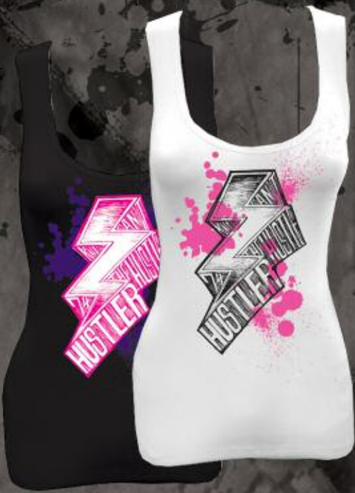
WT6000 ELECTRIC HUSTLE WHITE, BLACK 100% COTTON PRINTED JERSEY TANK S-XL