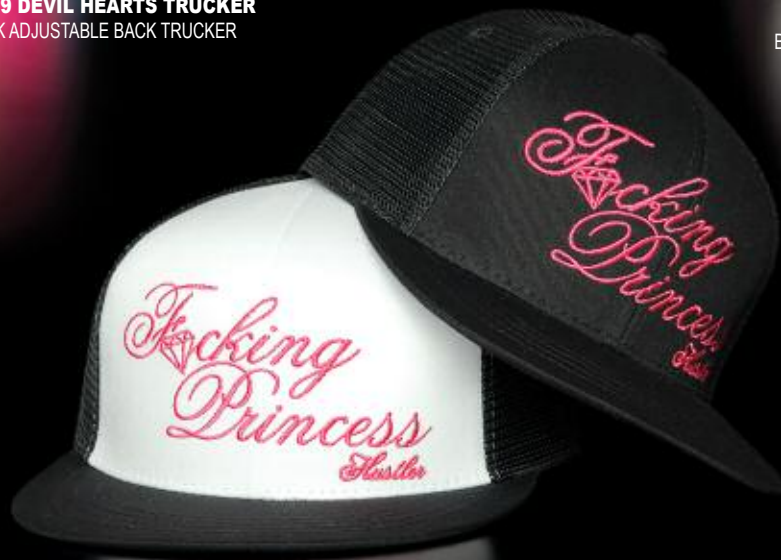
WH4011 F*CKING PRINCESS TRUCKER BLACK, WHITE ADJUSTABLE BACK TRUCKER