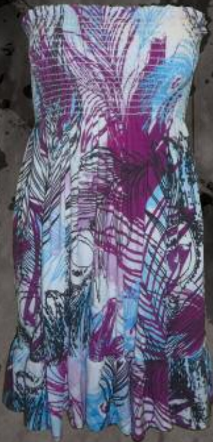
WD2001 BIRDY TUBE SMOCKED DRESS WITH PRINT 100% COTTON S-L