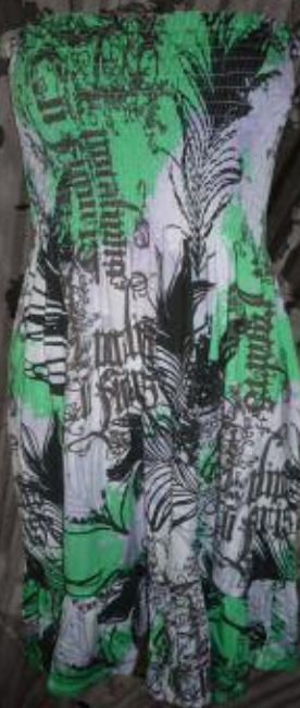
WD2002 DOVEY TUBE SMOCKED DRESS WITH PRINT 100% COTTON S-L