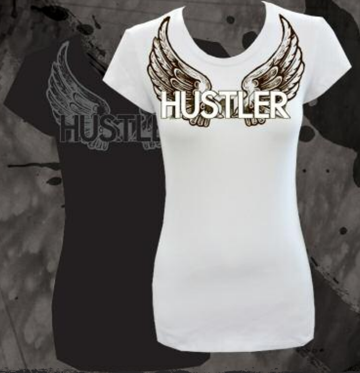
WR2148 FOREVER BLACK, WHITE 95% COTTON 5% SPANDEX PRINTED TEE S-XL