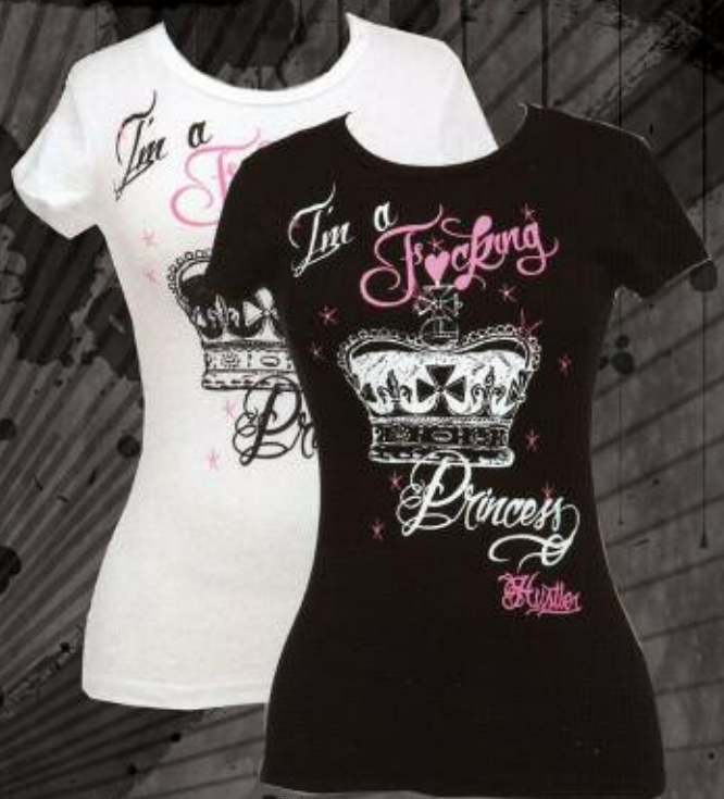
WR2069 PRINCESS BLACK, WHITE 100% COTTON PRINTED TEE W/ RHINESTONES S-XL