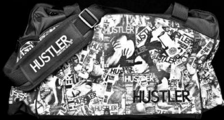
MA3002 COVERGIRL DUFFLE BLACK PRINTED & EMBROIDERED DUFFLE BAG W/ POCKETS