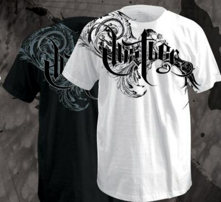
MR3021 RUN THIS TOWN SLIM WHITE, BLACK 100% COTTON PRINTED SLIM FIT TEE M-2XL