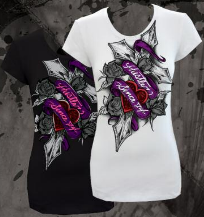
WR2166 HOPE WHITE, BLACK 95% COTTON 5% SPANDEX PRINTED TEE S-XL