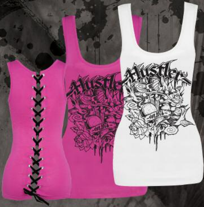
WT7003 HEARTLESS PINK, WHITE 100% COTTON PRINTED TANK WITH LACE UP BACK S-XL