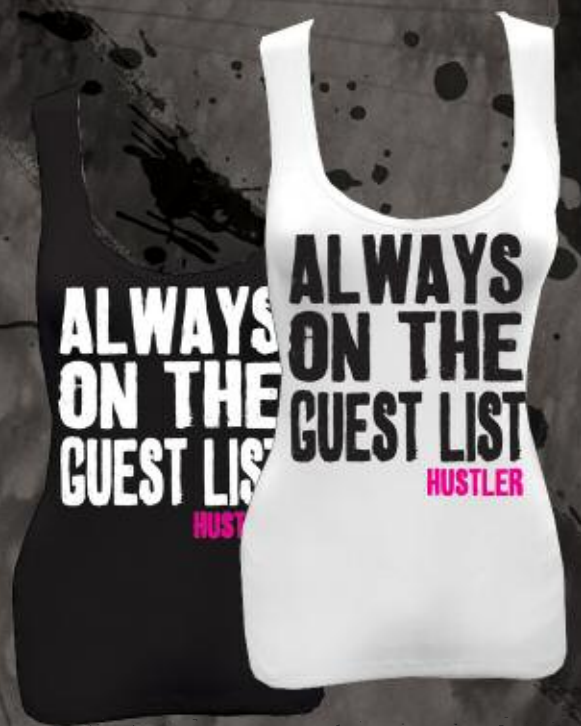
WT1054 GUEST LIST BLACK, WHITE 100% COTTON PRINTED RIBBED TANK S-XL