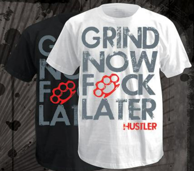
MR1286 GRIND WHITE, BLACK 100% COTTON PRINTED TEE M-2XL