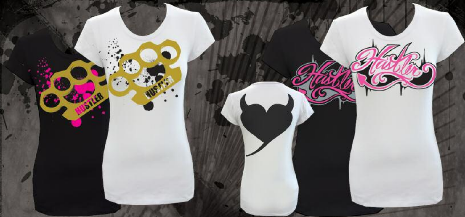
WR2140 GOLD WHITE, BLACK 95% COTTON 5% SPANDEX PRINTED TEE W/ GOLD FOIL S-XL