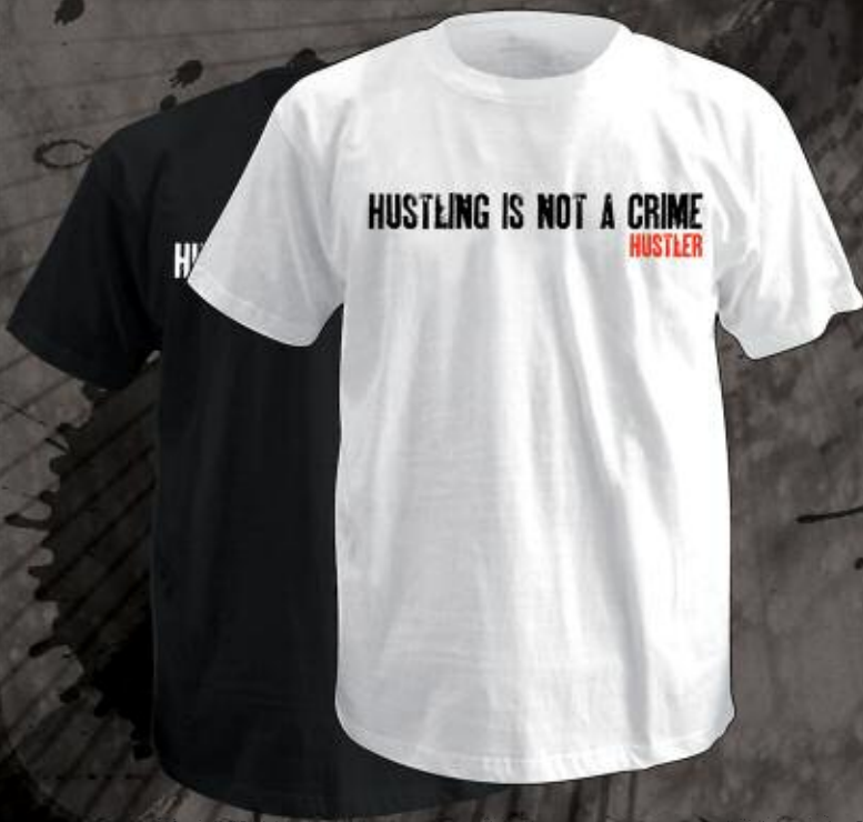
MR1287 CRIME WHITE, BLACK 100% COTTON PRINTED TEE M-2XL