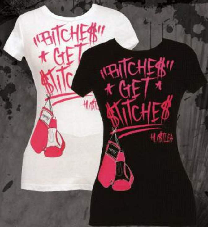
WR2068 STITCHES BLACK, WHITE 100% COTTON PRINTED TEE S-XL