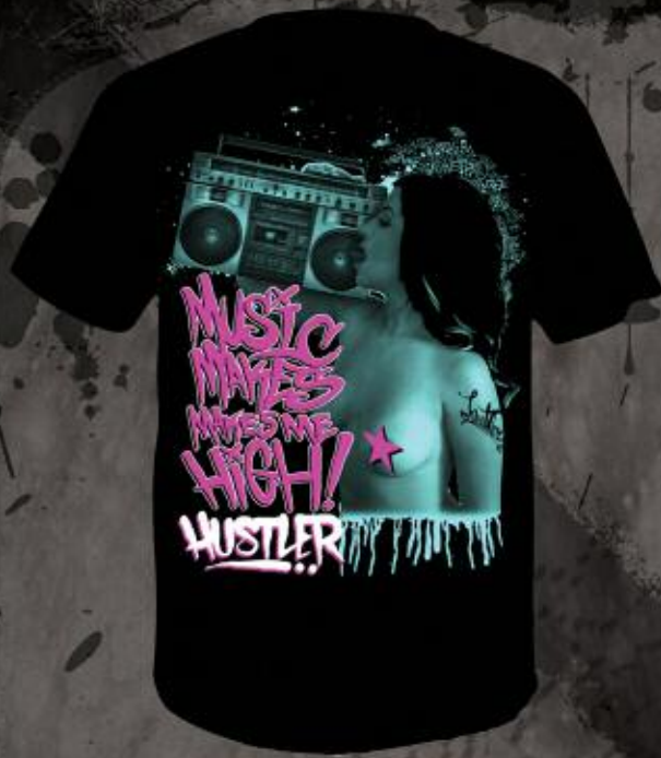
MR1276-MUSIC BLACK 100% COTTON PRINTED TEE M-2XL