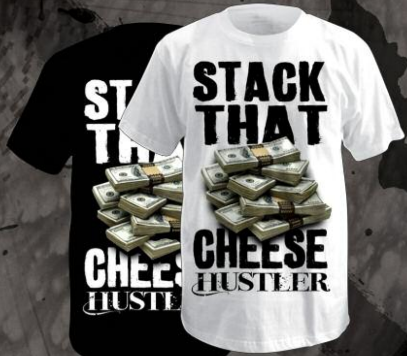
MR1269 STACK CHEESE WHITE, BLACK 100% COTTON PRINTED TEE M-2XL