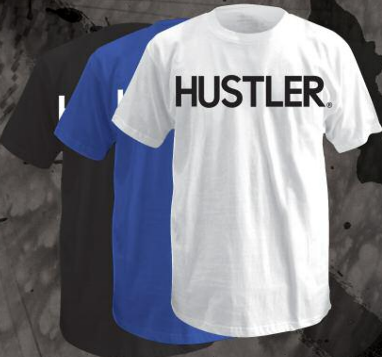
MR3025 CLASSIC SLIM BLACK, WHITE, ROYAL 100% COTTON PRINTED SLIM TEE M-2XL