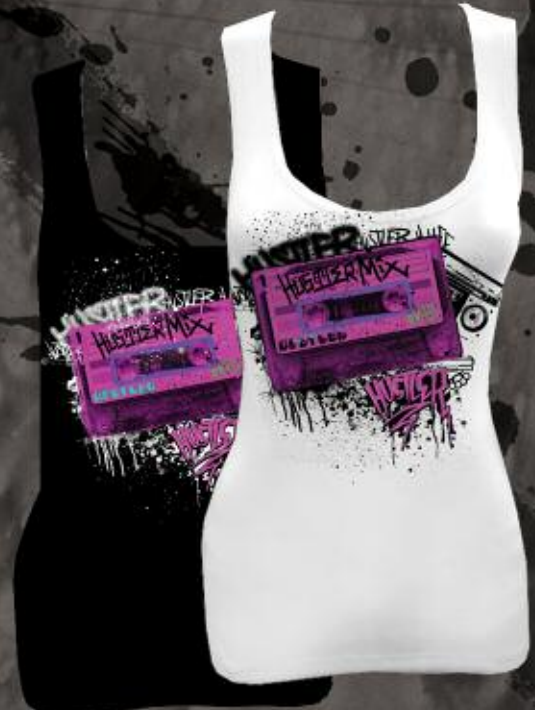
WT3075 CASETERO BLACK, WHITE-95% COTTON 5% SPANDEX PRINTED STRECH TANK S-XL