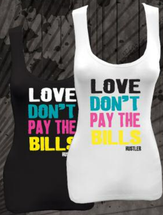
WT3080 LOVE DON'T PAY BLACK, WHITE 95% COTTON 5% SPANDEX PRINTED STRECH TANK S-XL