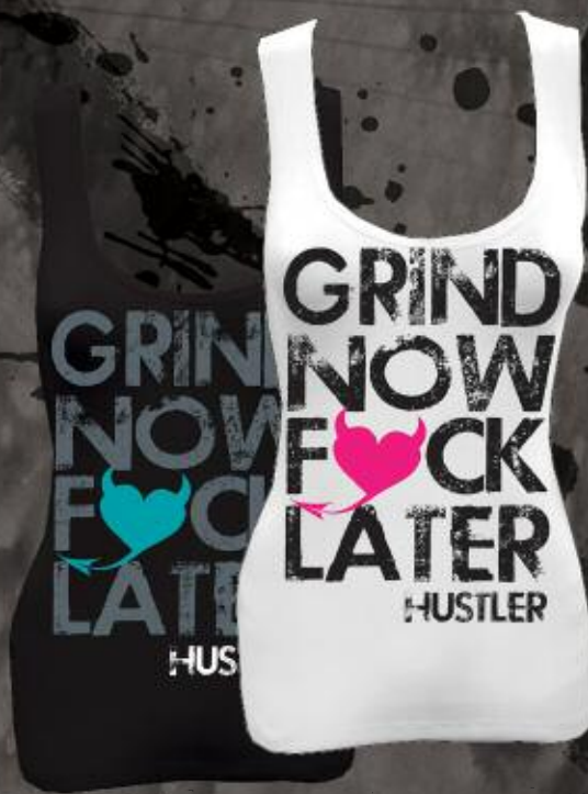
WT1060 GRIND WHITE, BLACK 100% COTTON PRINTED RIBBED TANK S-XL