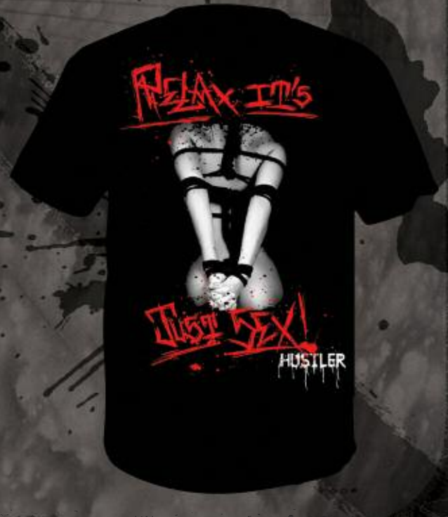
MR1275 TIED UP BLACK 100% COTTON PRINTED TEE M-2XL