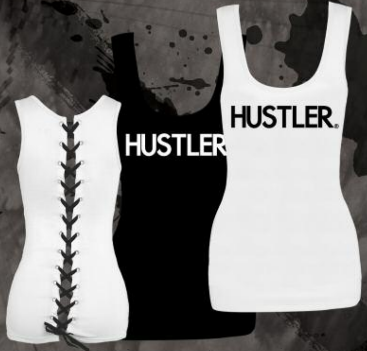
WT7000 CLASSIC BLACK, WHITE 100% COTTON PRINTED TANK WITH LACE UP BACK S-XL