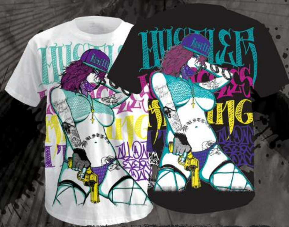
MR3016 FINA SLIM WHITE, BLACK 100% COTTON PRINTED SLIM FIT TEE M-2XL