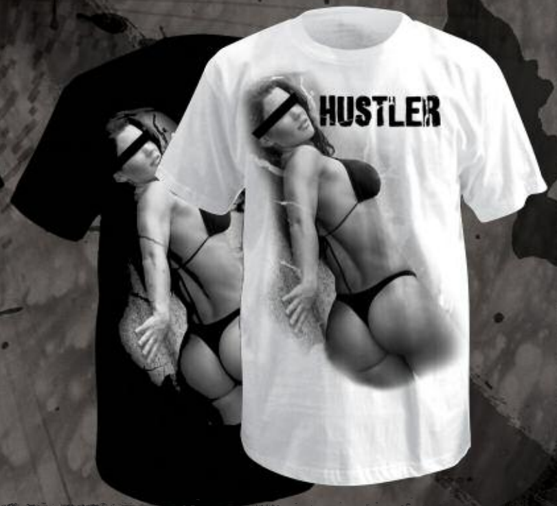
MR1271 HARD HITTERS WHITE, BLACK 100% COTTON PRINTED TEE M-2XL