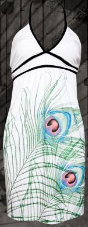
WD3003 PEACOCK HALTER DRESS WHITE 100% COTTON A-LINE EMPIRE WAIST DRESS WITH ADJUSTABLE TIES S-L