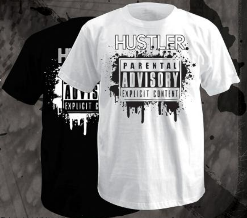
MR1290 EXPLICIT WHITE, BLACK 100% COTTON PRINTED TEE M-2XL