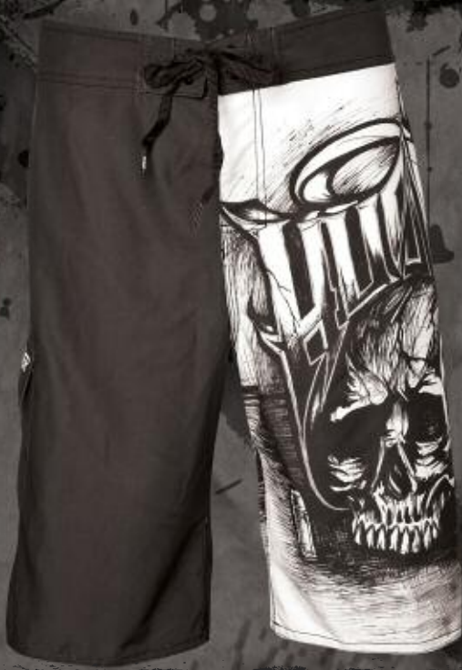
MS1014 VENGEANCE BLACK