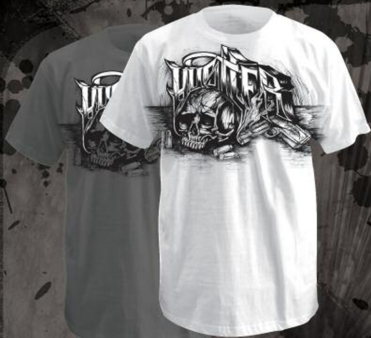
MR3022 VENGANCE SLIM WHITE, CHARCOAL 100% COTTON PRINTED SLIM FIT TEE M-2XL