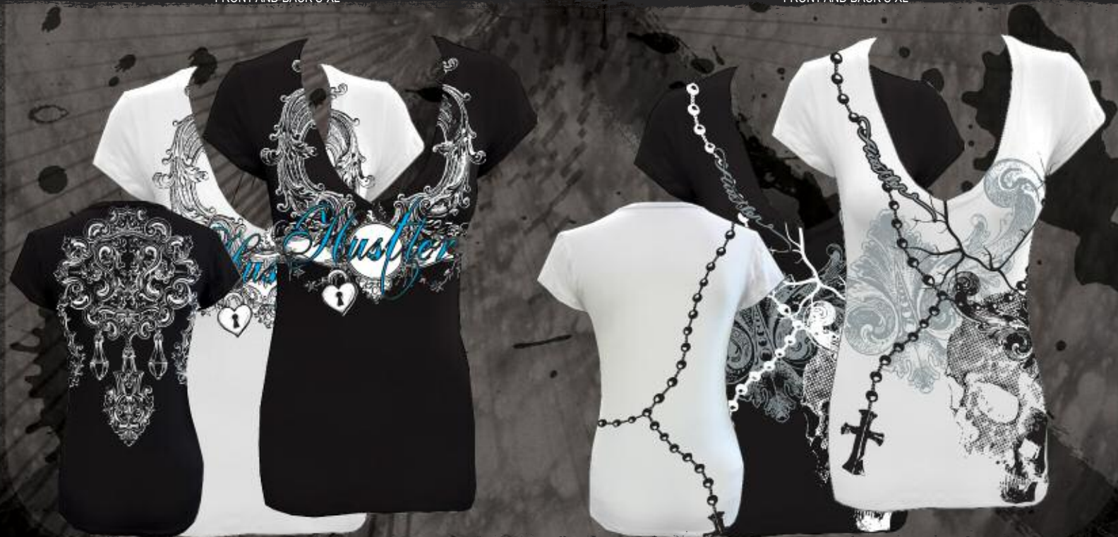
WR4027 LOCK HEART WHITE, BLACK 95% COTTON 5% SPANDEX PRINTED V-NECK FRONT AND BACK S-XL