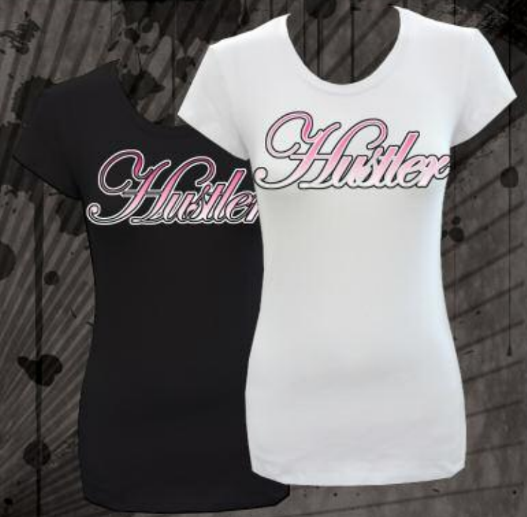
WR2127 CLASSIC GIRL WHITE, BLACK 95% COTTON 5% SPANDEX PRINTED TEE S-XL