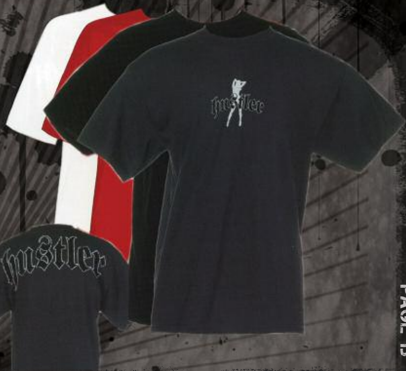
MR1016 MUD BLACK, CHARCOAL, RED, WHITE 100% COTTON PRINTED TEE S-2XL