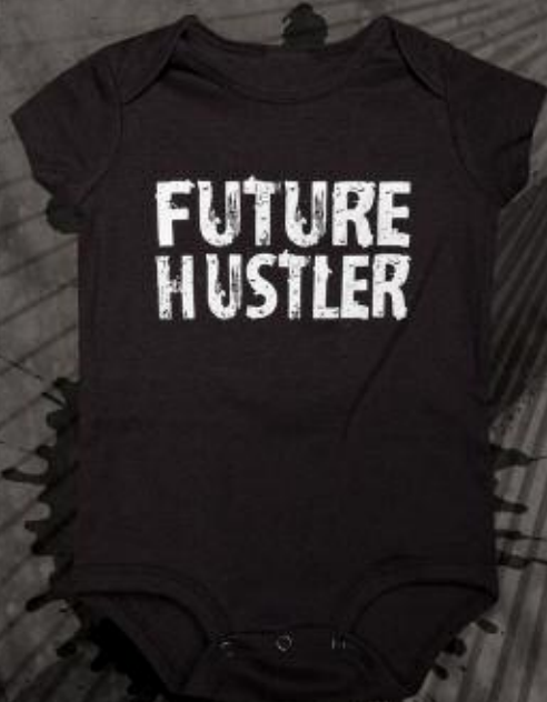
BR1010 FUTURE HUSTLER BLACK 100% COTTON SIZES 0-6, 6-12, 12-24