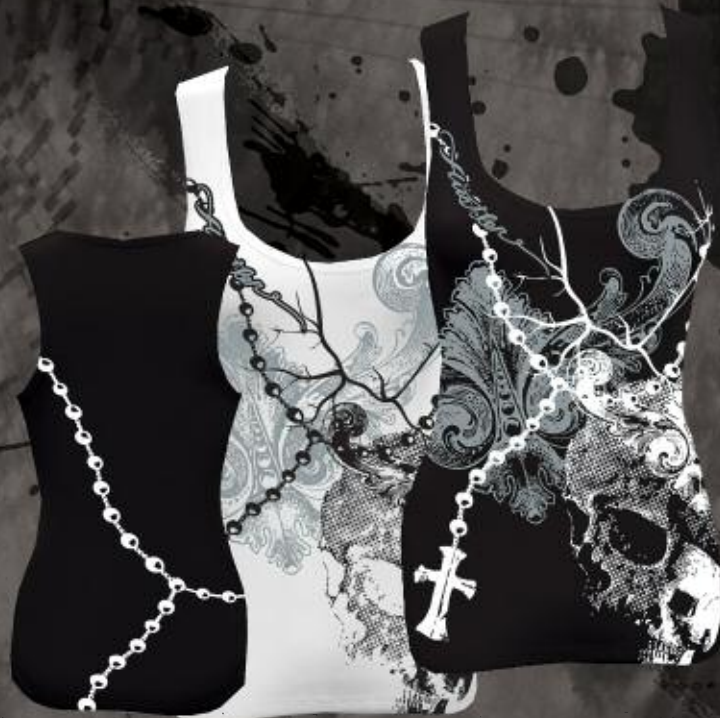
WT1057 GOTH WHITE, BLACK 100% COTTON PRINTED FRONT AND BACK RIBBED TANK S-XL