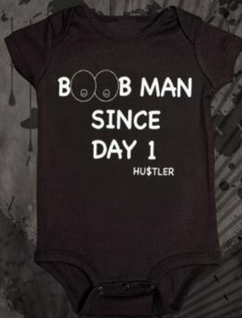
BR1008 SUCKER BLACK 100% COTTON SIZES 0-6, 6-12, 12-18, 18-24