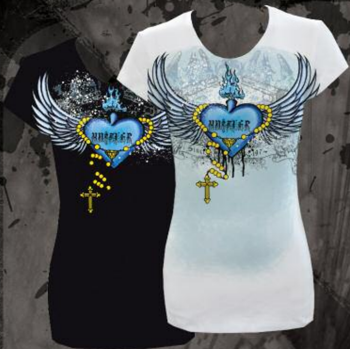
WR2169 THE BLUES WHITE, BLACK 95% COTTON 5% SPANDEX PRINTED TEE W/ GOLD FOIL S-XL