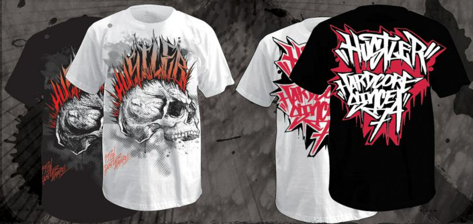
MR1254 MOHAWK BLACK, WHITE 100% COTTON PRINTED TEE M-2XL