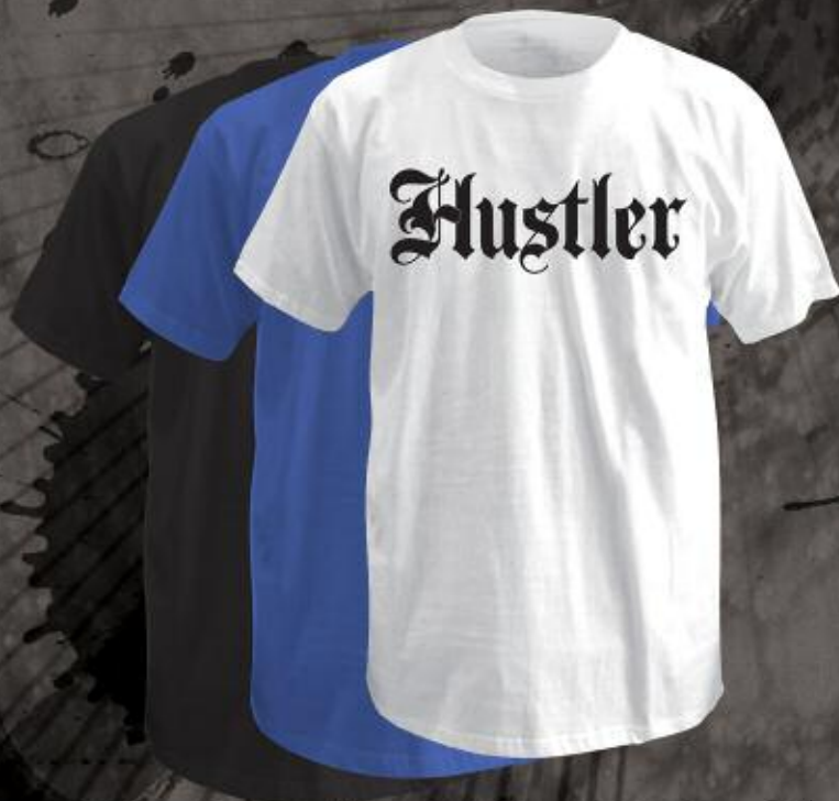
MR3011 OG SLIM WHITE, ROYAL, BLACK 100% COTTON PRINTED SLIM TEE M-2XL