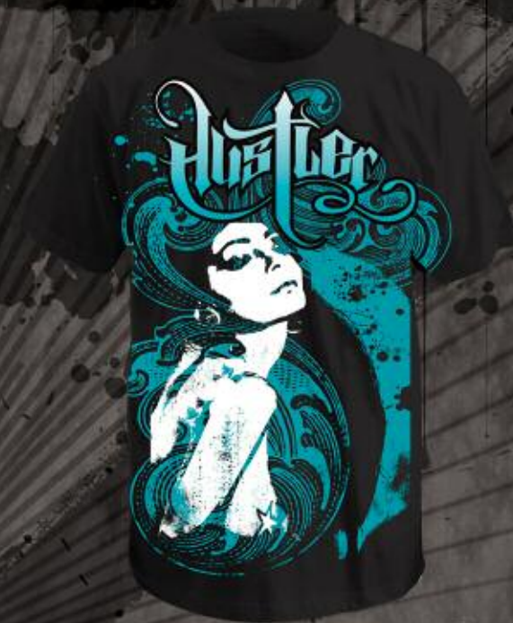
MR3019 SEDATED SLIM BLACK 100% COTTON PRINTED SLIM FIT TEE M-2XL