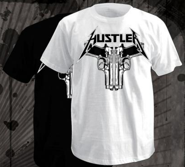
MR1289 METALICA WHITE, BLACK 100% COTTON PRINTED TEE M-2XL