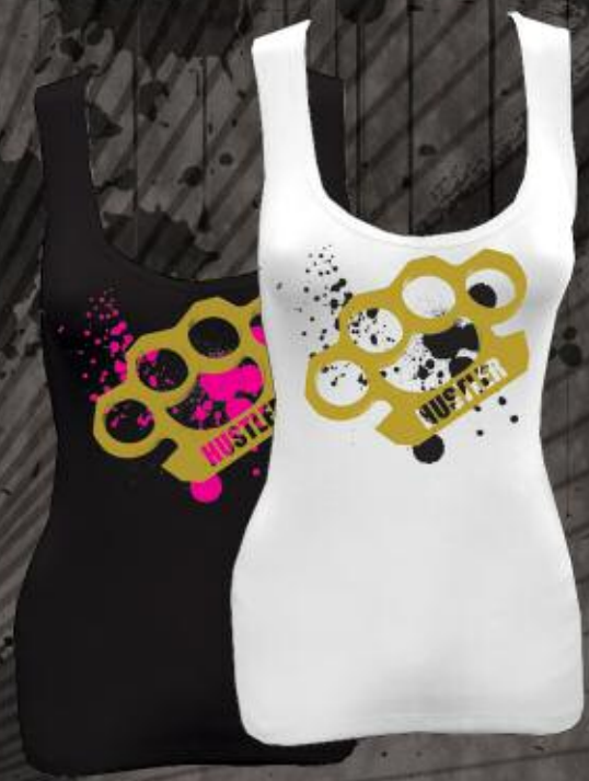
WT3084 GOLD BLACK, WHITE 95% COTTON 5% SPANDEX PRINTED STRECH TANK S-XL