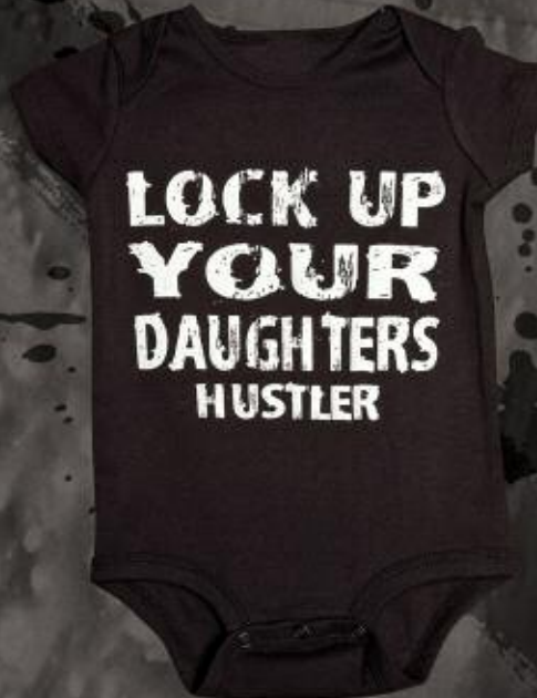
BR1015 LOCKED UP BLACK 100% COTTON SIZES 0-6, 6-12, 12-24