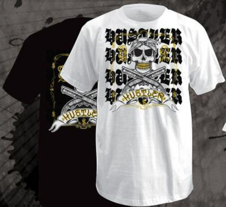
MR1285 HIT EM UP BLACK, WHITE-100% COTTON PRINTED TEE M-2XL