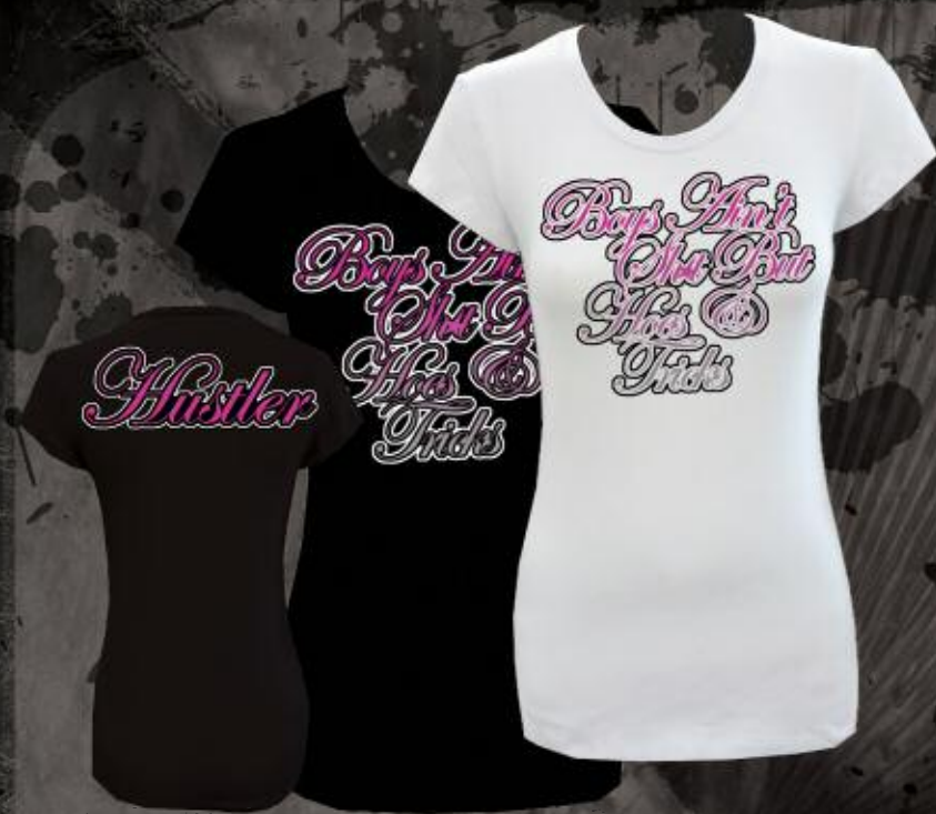
WR2122 BOYS AIN'T SHIT WHITE, BLACK 95% COTTON 5% POLYESTER PRINTED TEE FRONT & BACK S-XL