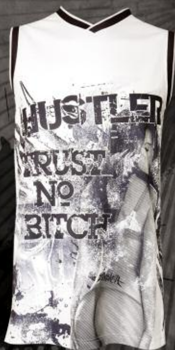
MP1002 TRUST NO BITCH JERSEY WHITE 100% POLYESTER M-2XL