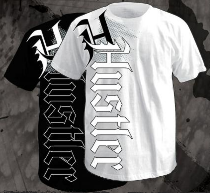
MR3030 CRUSH SLIM WHITE, BLACK 100% COTTON PRINTED SLIM FIT TEE M-2XL