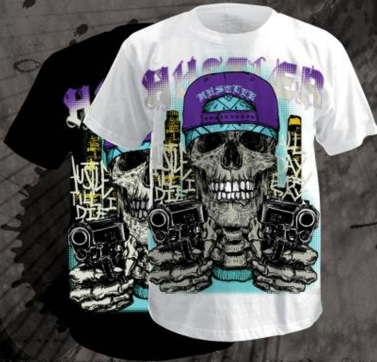
MR1279-LOKO BLACK, WHITE 100% COTTON PRINTED TEE WITH FOIL M-2XL