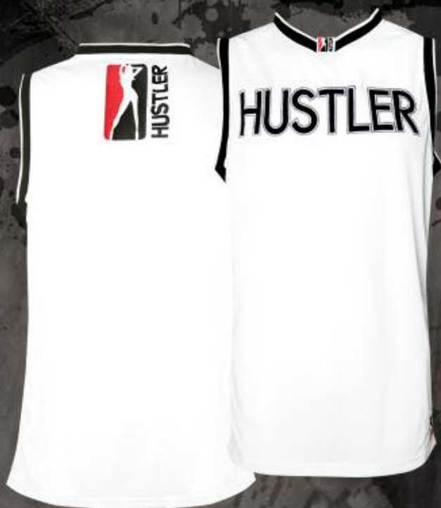
MP1006 LAP DANCE JERSEY BLACK, WHITE 100% POLYESTER M-2XL