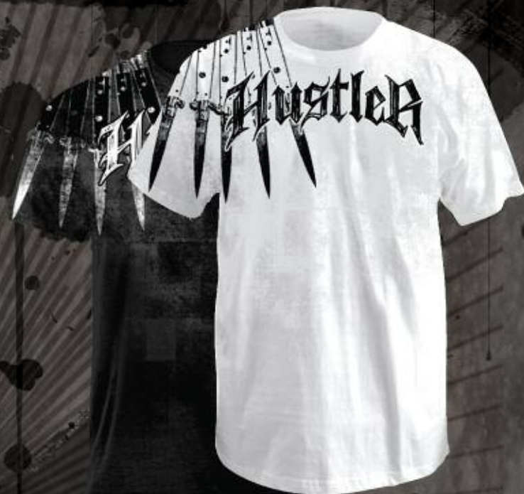
MR3012 SPINESHANK SLIM WHITE, BLACK 100% COTTON PRINTED SLIM FIT TEE M-2XL