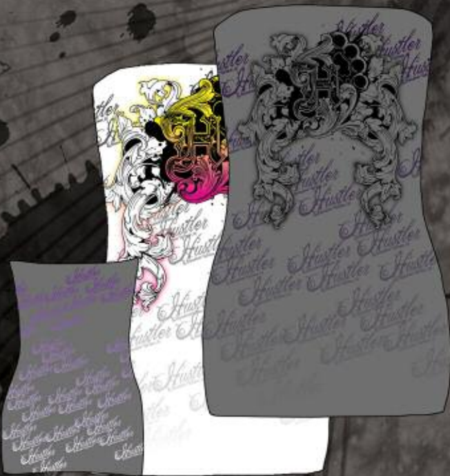
WT8001 SIGNATURE WHITE, CHARCOAL PRINTED TUBE TOP 95% COTTON 5% LYCRA WITH BUILT IN SUPPORT S-L