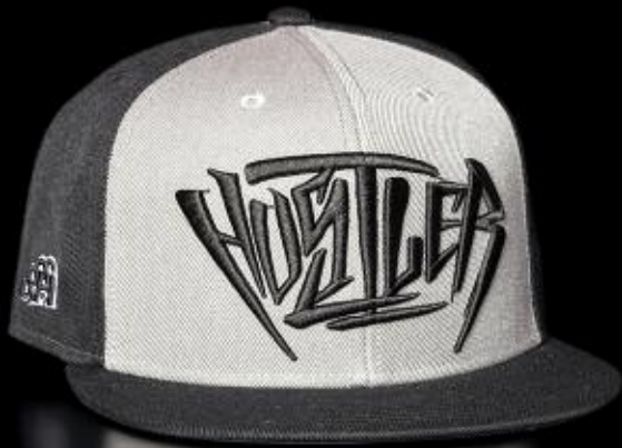
MH3027 GRINDING BLACK 3D EMBROIDERED FLAT BILLED HAT WITH UNDERBILL DETAIL WITH INSIDE TAPING S,M,L