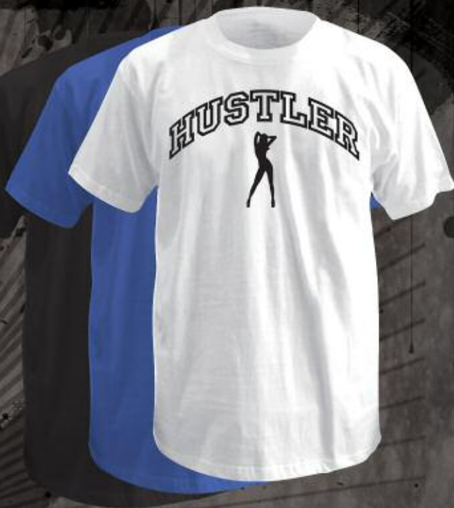
MR3008-STRIP SLIM WHITE, ROYAL, BLACK 100% COTTON PRINTED SLIM TEE M-2XL