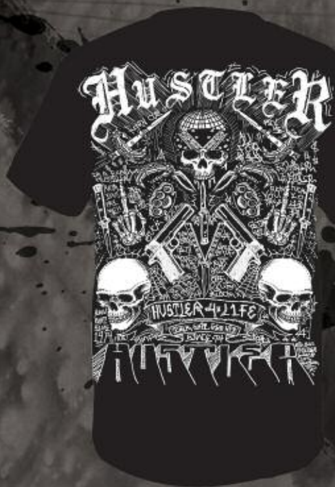
MR1277 4 LIFE BLACK 100% COTTON PRINTED TEE M-2XL