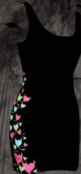
WD3008 DEVIL HEARTS BLACK 98% COTTON 2% LYCRA COTTON PRINTED DRESS S-L