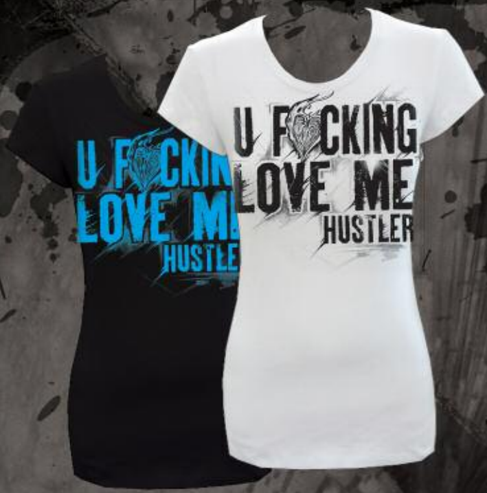
WR2149 LOVE ME WHITE, BLACK 95% COTTON 5% SPANDEX PRINTED TEE S-XL