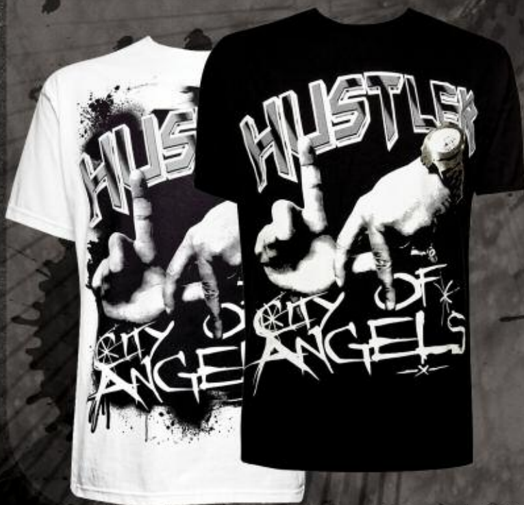
MR1231 AVENGER BLACK, WHITE 100% COTTON PRINTED TEE WITH FOIL M-2XL