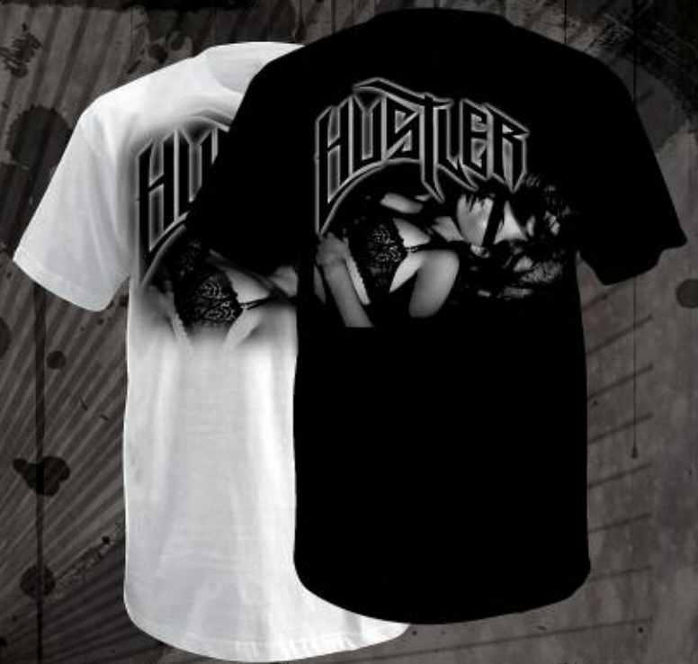
MR1257 BLINDED WHITE, BLACK 100% COTTON PRINTED TEE M-2XL