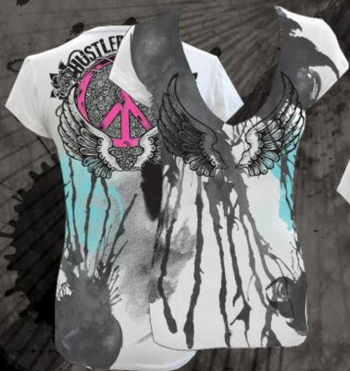
WR4024 PEACE WHITE 95% COTTON 5% SPANDEX PRINTED V-NECK FRONT & BACK S-XL