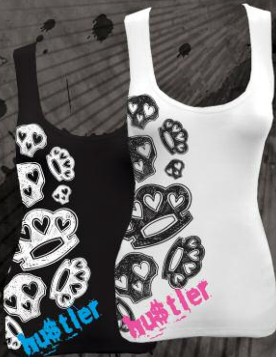
WT3076 TUFF LOVE 10 BLACK, WHITE 95% COTTON 5% SPANDEX PRINTED STRECH TANK S-XL