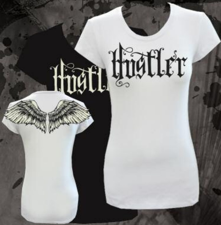
WR2167 LOST SOUL WHITE, BLACK 95% COTTON 5% SPANDEX PRINTED TEE S-XL