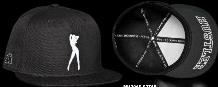
MH3015 STRIP BLACK EMBROIDERED FLAT BILLED HAT WITH UNDERBILL DETAIL AND INSIDE TAPING S,M,L