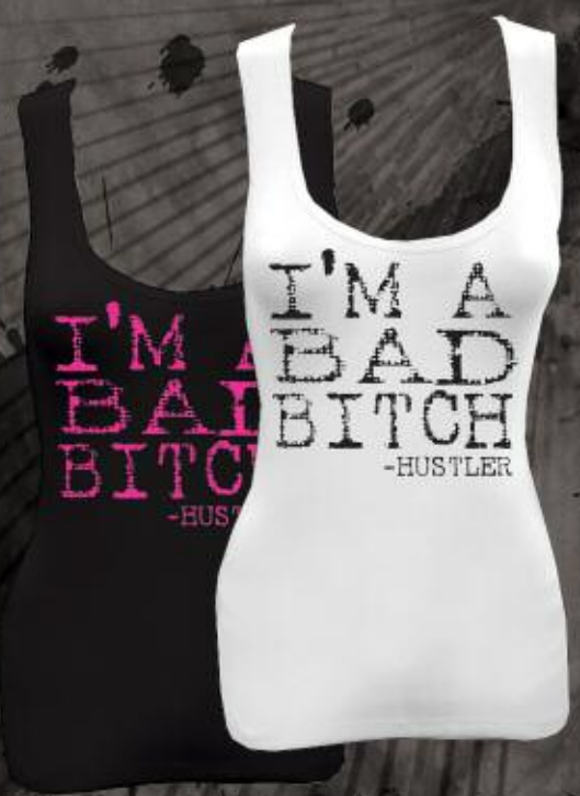
WT3072 BAD BLACK, WHITE 95% COTTON 5% SPANDEX PRINTED STRECH TANK S-XL