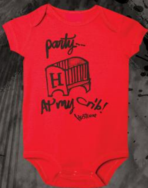
BR1013 PARTY AT MY CRIB RED 100% COTTON SIZES 0-6, 6-12, 12-24