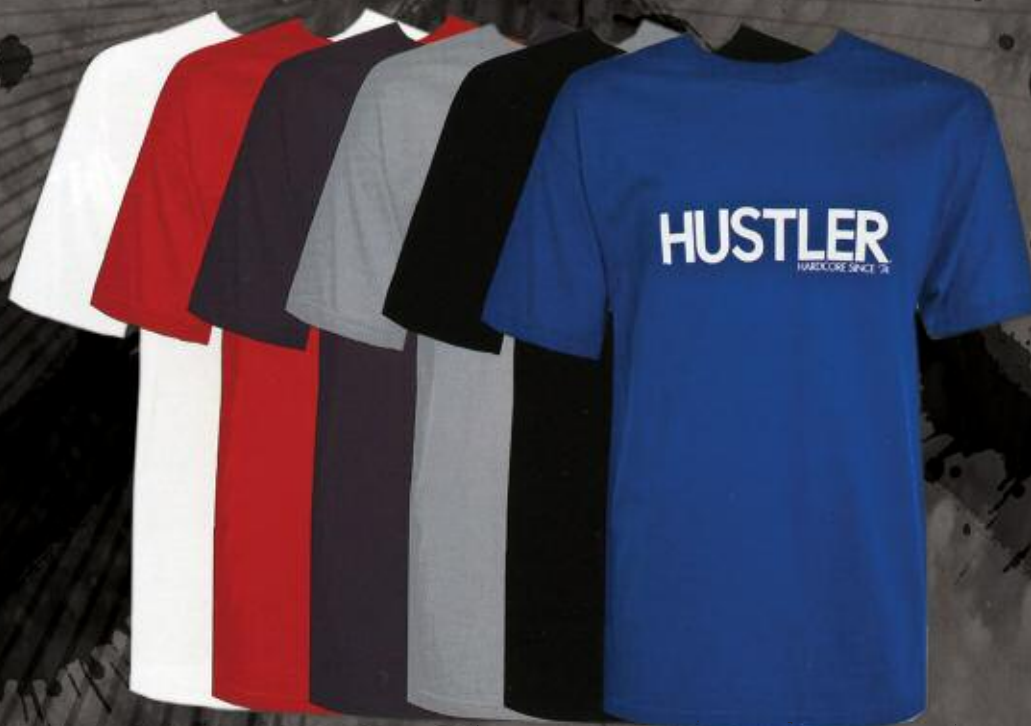
HU90208R CLASSIC BLACK/WHITE BLACK/RED, ROYAL, GREY, CHARCOAL, RED, WHITE 100% COTTON S-2XL