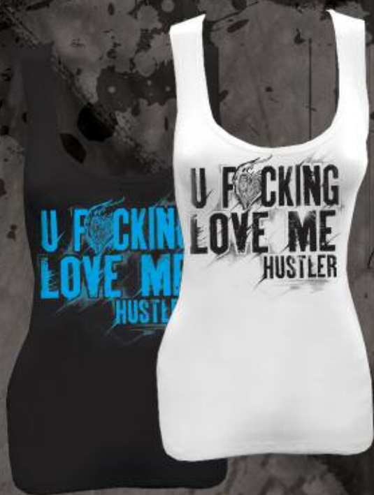
WT3079 LOVE ME BLACK, WHITE 95% COTTON 5% SPANDEX PRINTED STRECH TANK S-XL