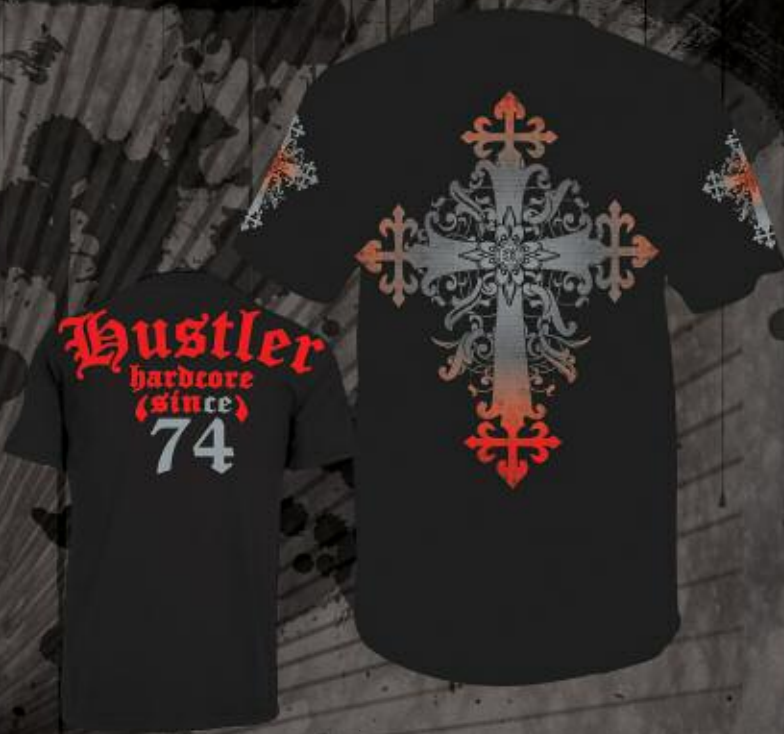
MR5026 CROSS FLYNT BLACK 100% COTTON PRINTED SLIM TEE FRONT & BACK WITH STUD DETAIL M-2XL