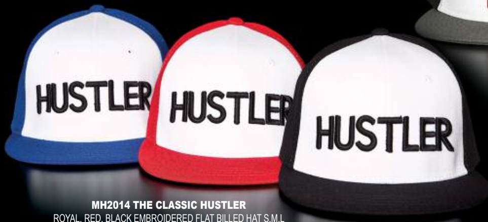
MH2014 THE CLASSIC HUSTLER ROYAL, RED, BLACK EMBROIDERED FLAT BILLED HAT S,M,L