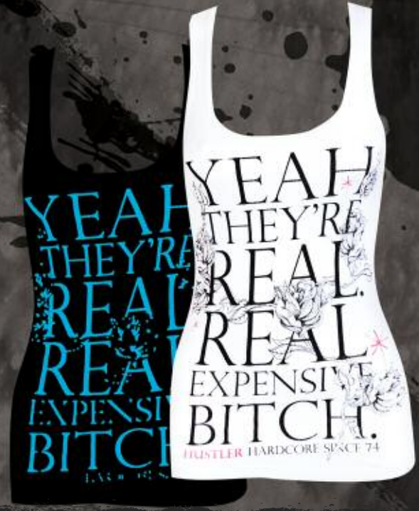
WT1050 PLASTIC BLACK, WHITE 100% COTTON PRINTED RIBBED TANK S-XL