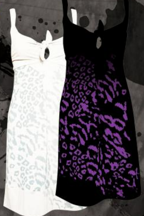
WD3000 KITTEN WHITE, GREY 98% COTTON 2% LYCRA TIE FRONT DRESS S-L