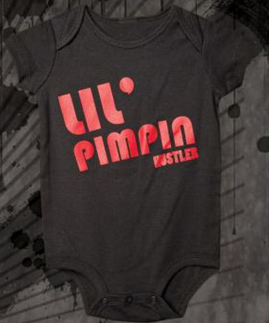
BR1011 LIL' PIMPIN BLACK 100% COTTON SIZES 0-6, 6-12, 12-24