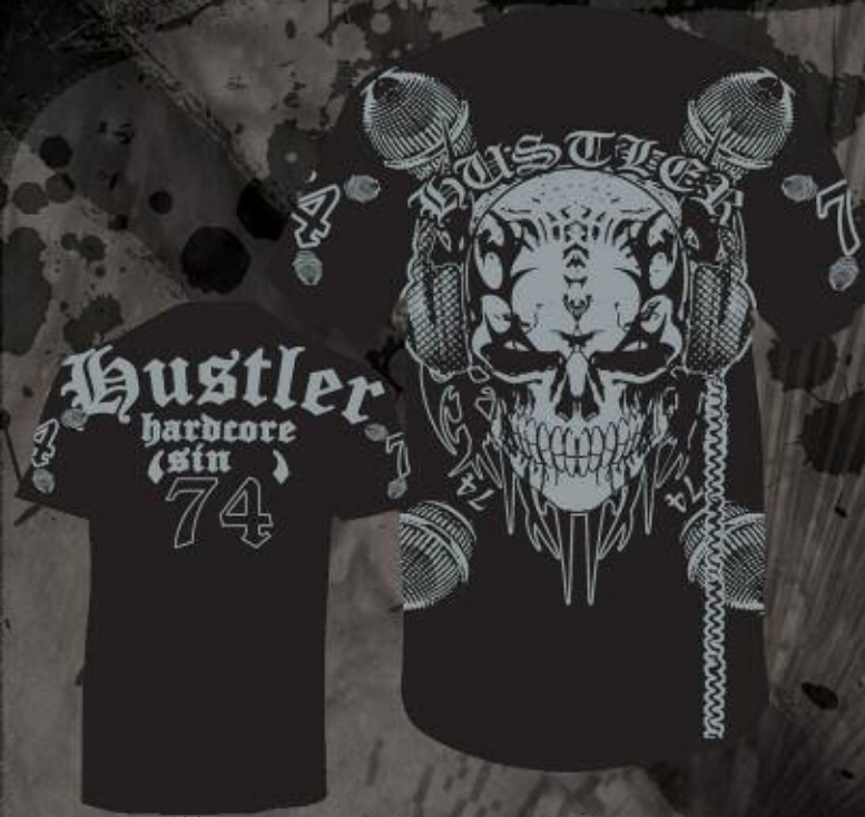
MR5025 MIC FLYNT BLACK 100% COTTON PRINTED SLIM TEE FRONT AND BACK M-2XL