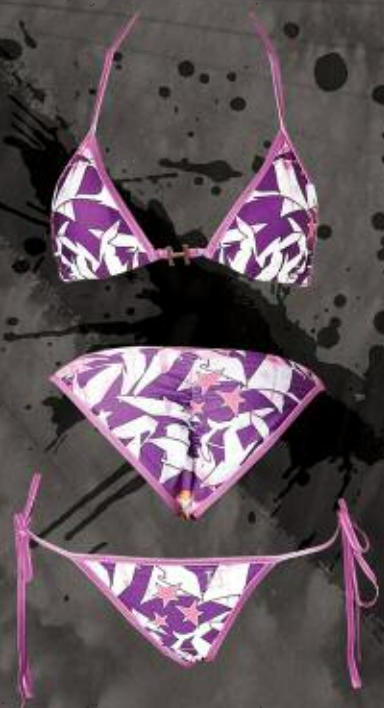
WS3011 STREET DREAMS PURPLE TRIANGLE TOP