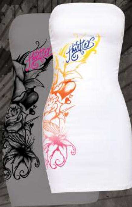
WD2004 FLOWER BOMB GREY, WHITE 95% COTTON 5% LYCRA PRINTED TUBE DRESS WITH BUILT IN SUPPORT S-L