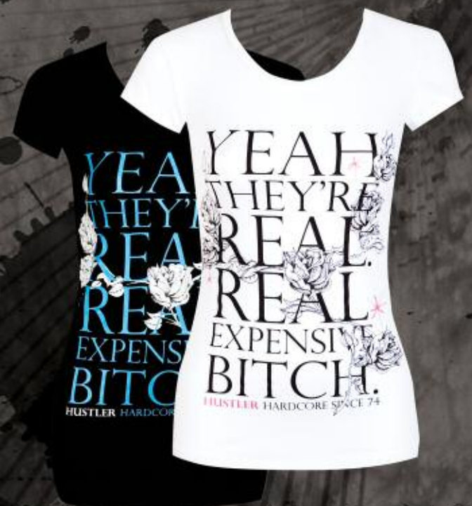
WR2095 PLASTIC BLACK, WHITE 100% COTTON PRINTED TEE S-XL