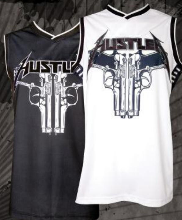
MP1001 METAL JERSEY BLACK, WHITE 100% POLYESTER M-2XL