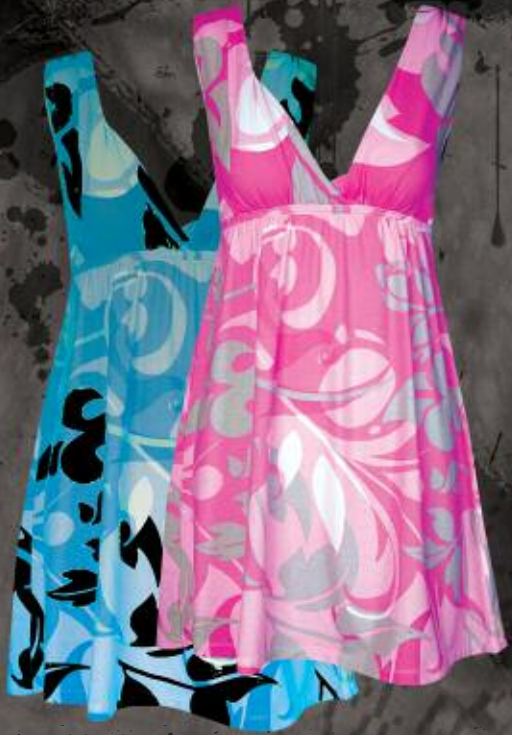
WD3006 SECRETS BLUE, PINK 100% COTTON SLEEVELESS EMPIRE WAIST DRESS S-L