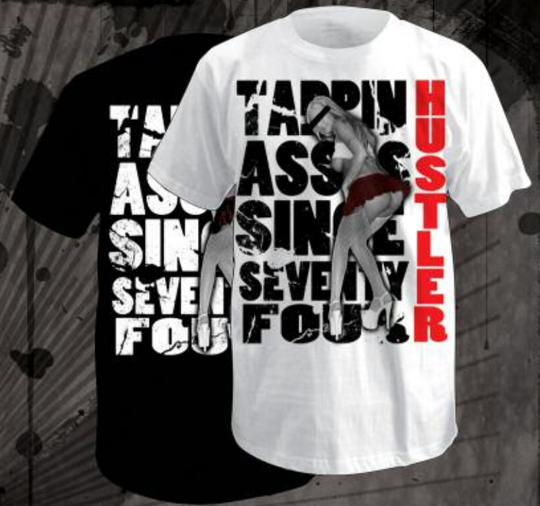
MR1268 TAPPIN SINCE 74 WHITE, BLACK 100% COTTON PRINTED TEE M-2XL