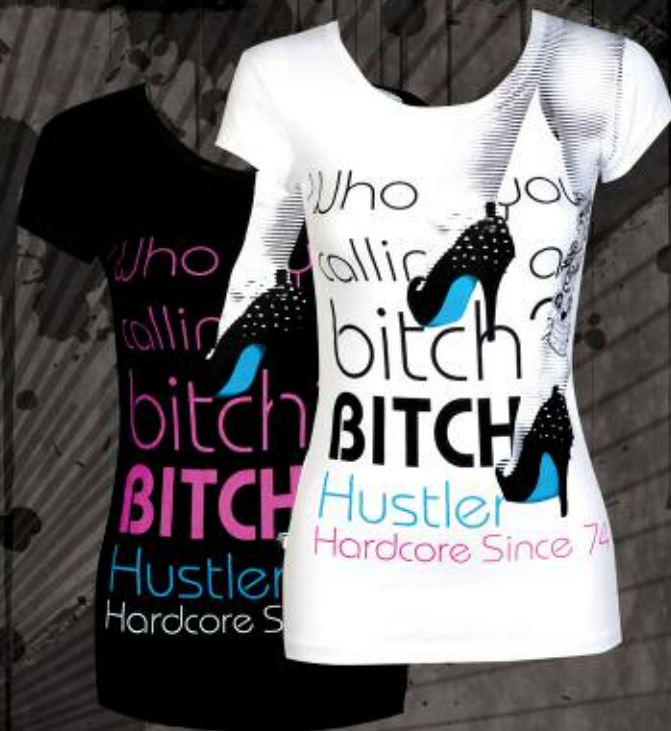
WR2107 CALL OUT BLACK, WHITE 96% COTTON 4% SPANDEX PRINTED TEE S-XL