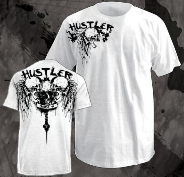
MR3026 NO ANGELS SLIM BLACK, WHITE 100% COTTON PRINTED SLIM FIT TEE M-2XL