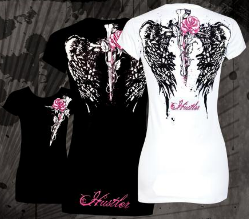
WR2131 HEARTLESS BITCH WHITE, BLACK 95% COTTON 5% SPANDEX PRINTED TEE S-XL