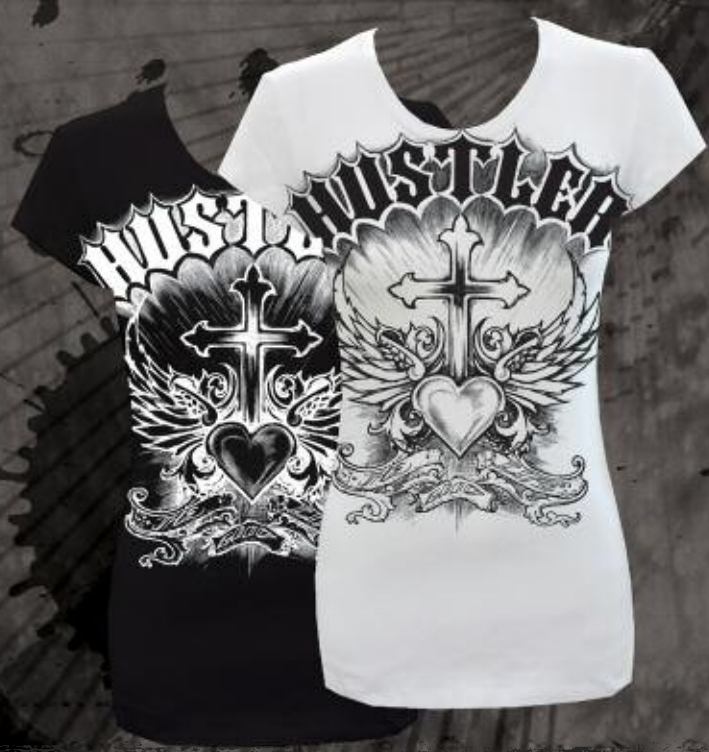
WR2147 THE GOOD LIFE WHITE, BLACK 95% COTTON 5% SPANDEX PRINTED TEE S-XL