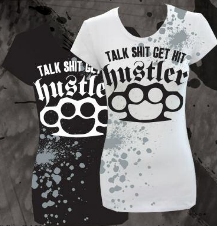
WR2132 TALK SHIT 10 WHITE, BLACK 95% COTTON 5% SPANDEX PRINTED TEE S-XL