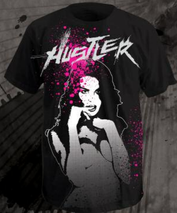
MR3020 VANITY SLIM BLACK 100% COTTON PRINTED SLIM FIT TEE M-2XL