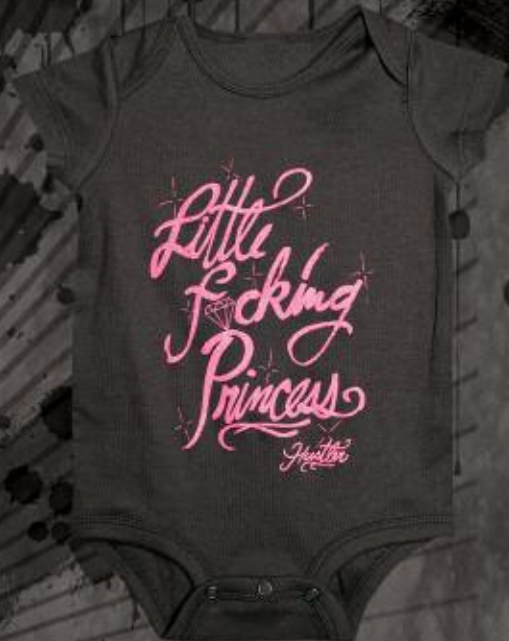
GR1001 DIAMOND PRINCESS BLACK 100% COTTON SIZES 0-6, 6-12, 12-24