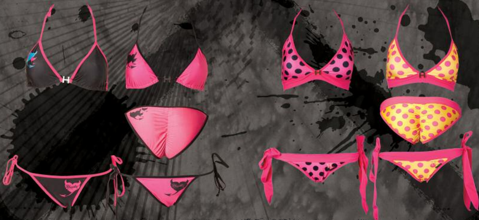
WS3009 SHE DEVIL PINK, BLACK TRIANGLE TOP WS4009 SHE DEVIL PINK, BLACK SCRUNCHY BOTTOMS