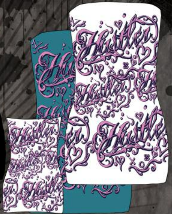
WT8003 XOXO WHITE, TEAL PRINTED TUBE TOP 95% COTTON 5% LYCRA WITH BUILT IN SUPPORT S-L