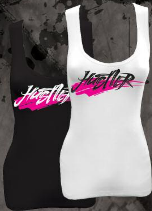
WT4000 STRIKER WHITE, BLACK 100% COTTON PRINTED JERSEY RACER BACK TANK S-XL