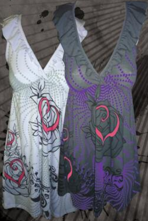
WD3004 ROSY HEARTS RUFFLE DRESS WHITE, GREY 100% COTTON EMPIRE WAIST WITH RUFFLE DETAIL S-L