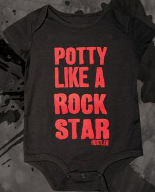
BR1012 POTTY BLACK 100% COTTON SIZES 0-6, 6-12, 12-24