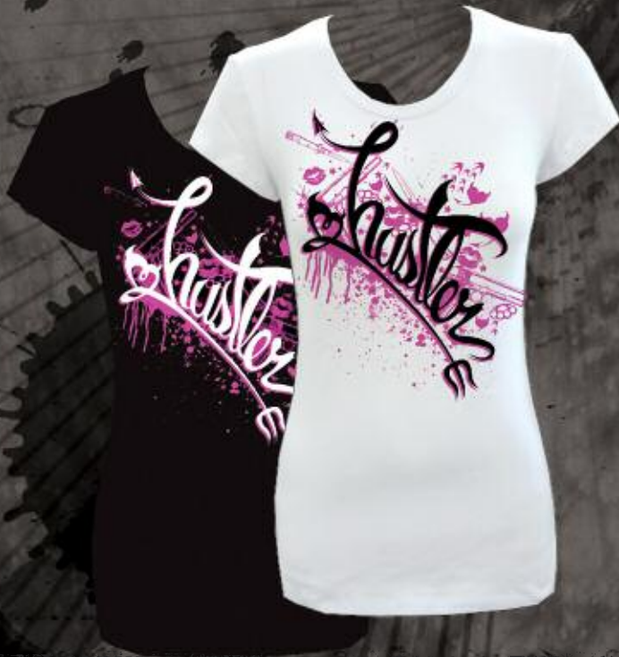
WR2120 SHE DEVIL WHITE, BLACK 95% COTTON 5% SPANDEX PRINTED TEE S-XL