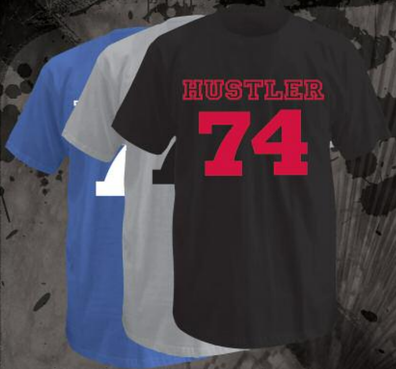
MR3007 HUSTLER 74 SLIM BLACK, HEATHER GREY, ROYAL 100% COTTON PRINTED SLIM TEE M-2XL