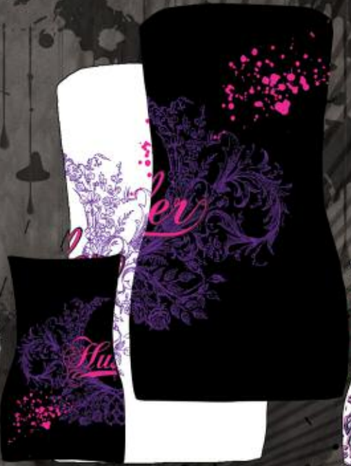
WT8002 COTTON CANDY BLACK, WHITE PRINTED TUBE TOP 95% COTTON 5% LYCRA WITH BUILT IN SUPPORT S-L