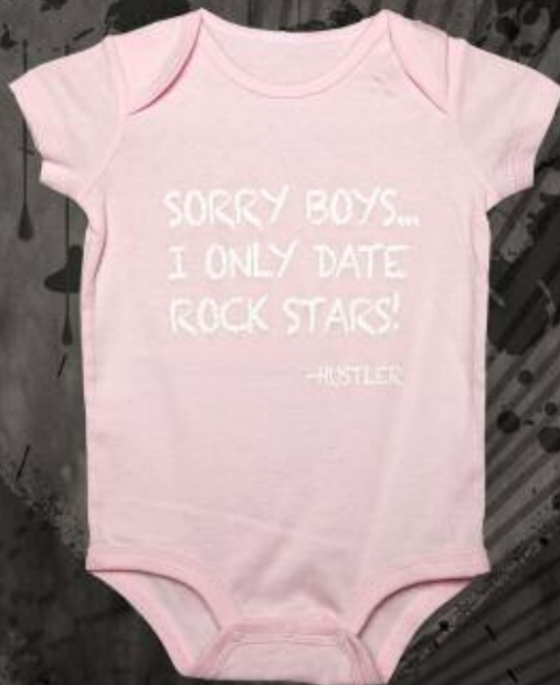
GR1002 ONLY ROCK STARS PINK 100% COTTON SIZES 0-6, 6-12, 12-24