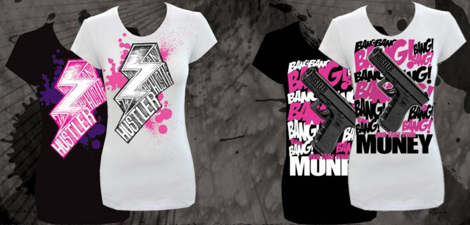
WR2125 ELECTRIC HUSTLE WHITE, BLACK 95% COTTON 5% SPANDEX PRINTED TEE S-XL