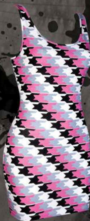
WD3009 HOUNDSTOOTH PINK 98% COTTON 2% LYCRA MULTI-PRINT PRINTED DRESS S-L