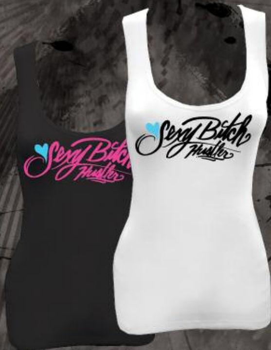
WT1055 SEXY BITCH BLACK, WHITE 100% COTTON PRINTED RIBBED TANK S-XL