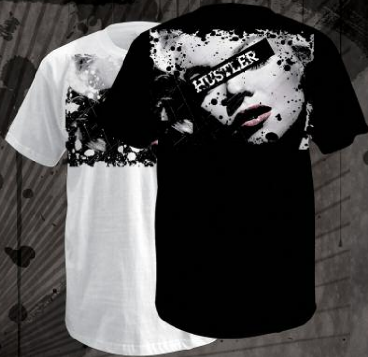
MR1256 MONROE WHITE, BLACK 100% COTTON TEE M-2XL