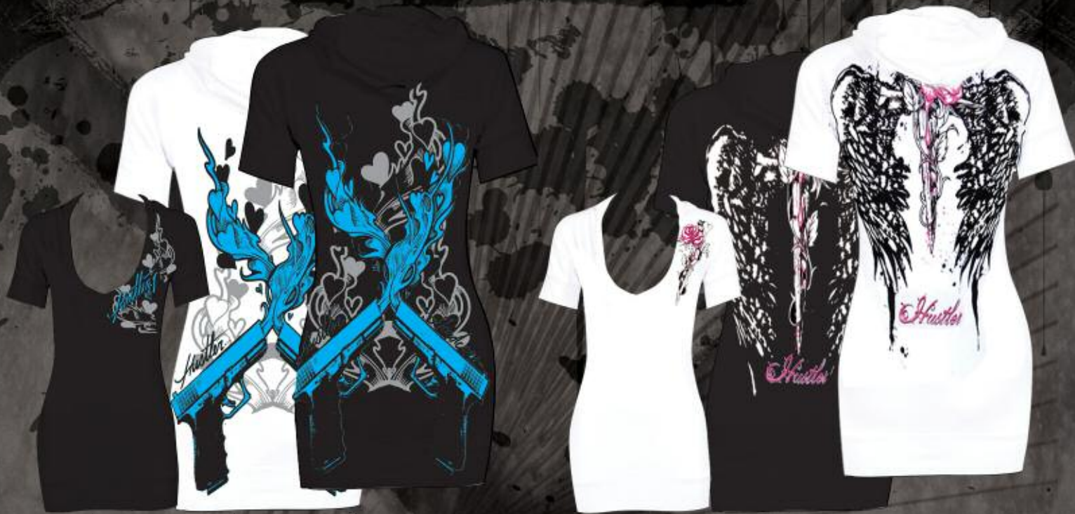
WD6002 HEART SMOKE BLACK, WHITE 95% COTTON 5% LYCRA PRINTED HOODIE DRESS S-XL