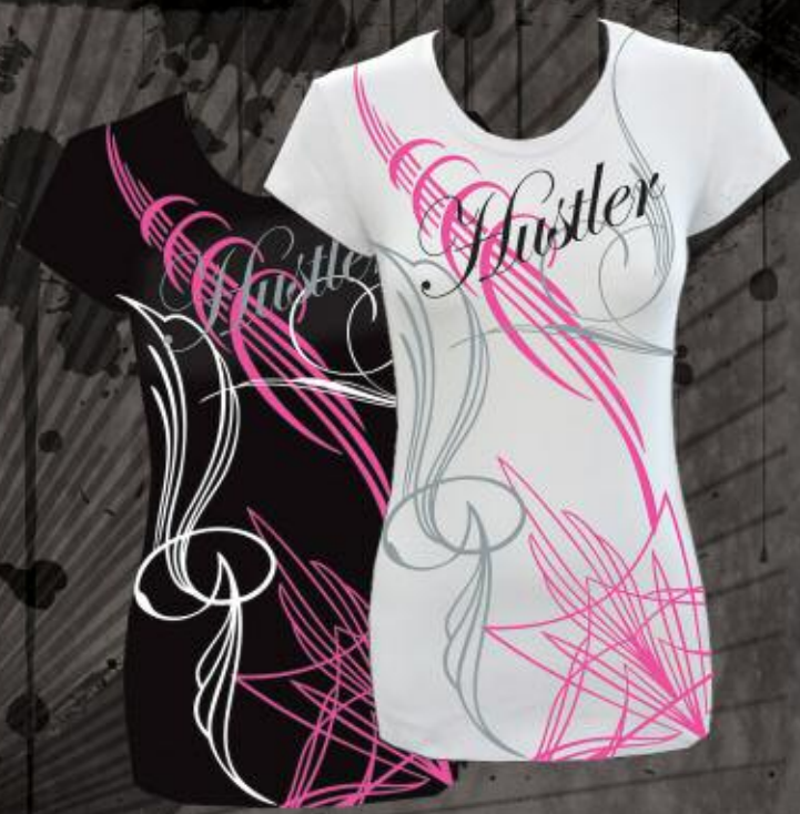
WR2129 BEAUTY WHITE, BLACK 95% COTTON 5% SPANDEX PRINTED TEE S-XL