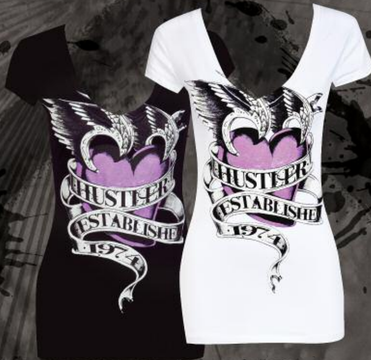
WR4017 FLYING HEART BLACK, WHITE 96% COTTON 4% SPANDEX PRINTED V-NECK S-XL