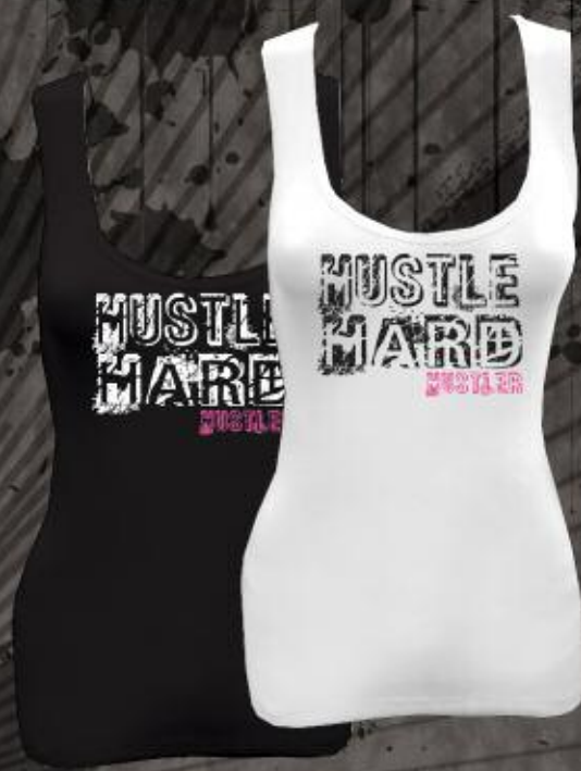
WT1063 HUSTLE HARD BLACK, WHITE 100% COTTON PRINTED RIBBED TANK S-XL