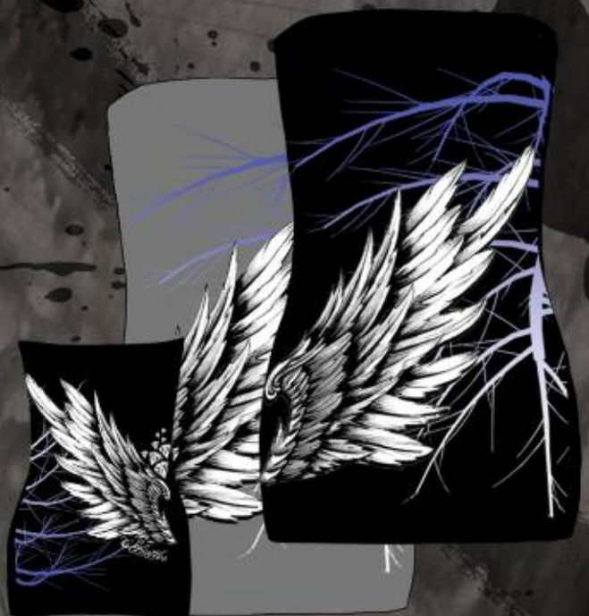
WT8000 FLY LEAF BLACK, CHARCOAL PRINTED TUBE TOP 95% COTTON 5% LYCRA WITH BUILT IN SUPPORT S-L