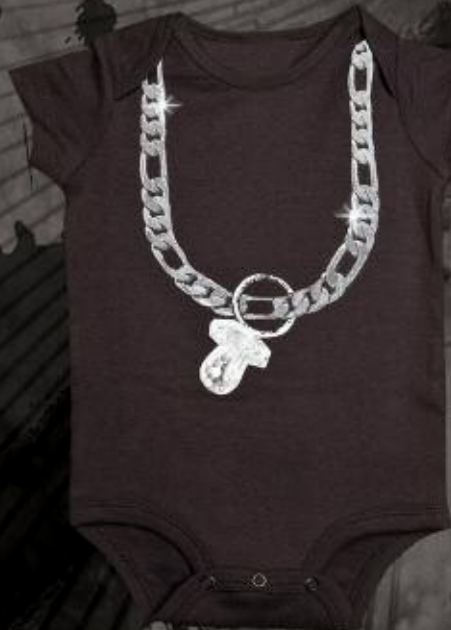
BR1014 BLING'D OUT BLACK 100% COTTON SIZES 0-6, 6-12, 12-24