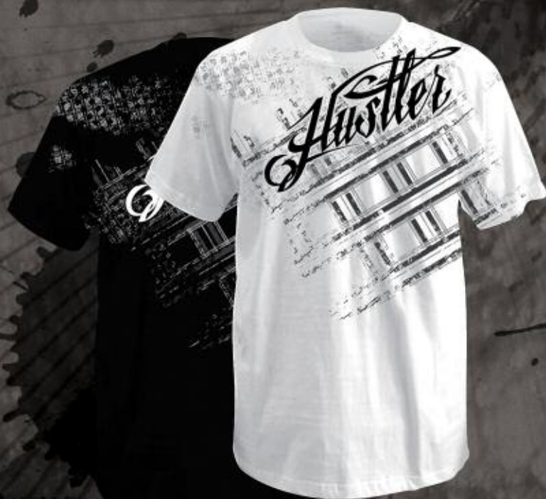
MR3013 PLAID SLIM WHITE, BLACK 100% COTTON PRINTED SLIM FIT TEE M-2XL