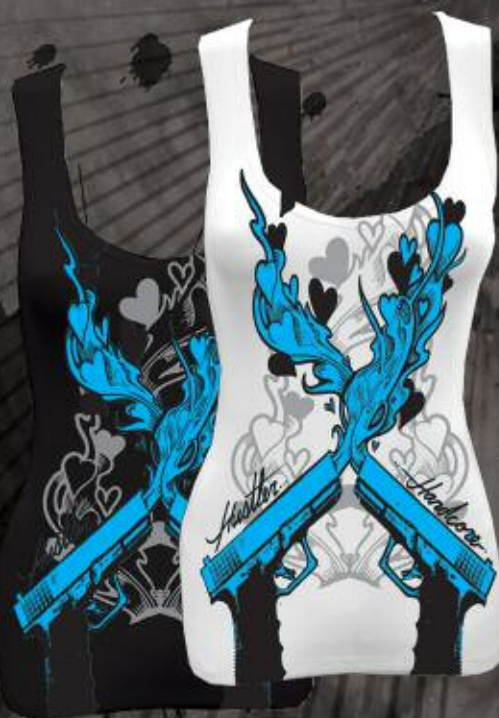
WT3071 HEART SMOKE BLACK, WHITE 95% COTTON 5% SPANDEX PRINTED STRECH TANK S-XL