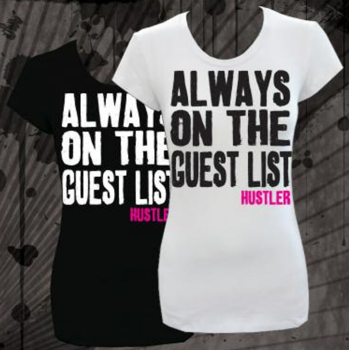
WR2150 GUEST LIST WHITE, BLACK 95% COTTON 5% SPANDEX PRINTED TEE S-XL