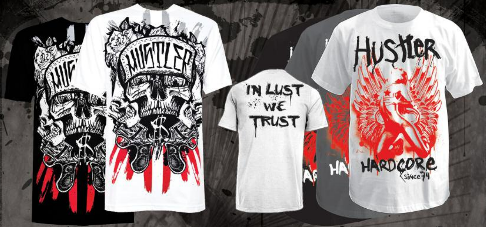
MR1245 GANGSTA TEE BLACK, WHITE 100% COTTON PRINTED TEE M-2XL