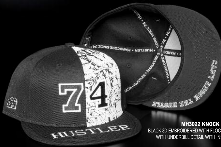
MH3022 KNOCK OUT BLACK 3D EMBROIDERED WITH FLOCKING FLAT BILLED HAT WITH UNDERBILL DETAIL WITH INSIDE TAPING S,M,L