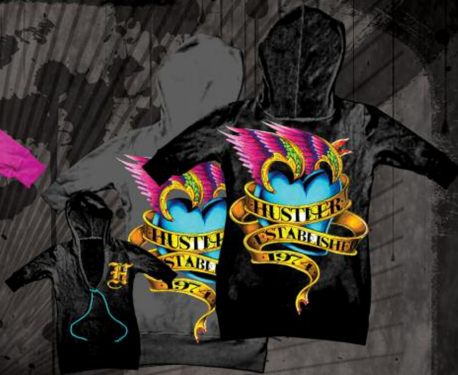
WC2000 FLYING HEARTS BLACK, CHARCOAL 100% COTTON PRINTED HOODIE PULLOVER S-XL