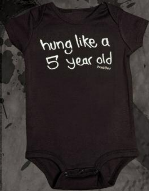
BR1002 HUNG LIKE A 5 YEAR OLD BLACK 100% COTTON SIZES 0-6, 6-12, 12-18, 18-24