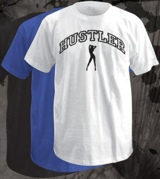
MR1263 STRIP WHITE, BLUE, BLACK 100% COTTON PRINTED TEE M-2XL