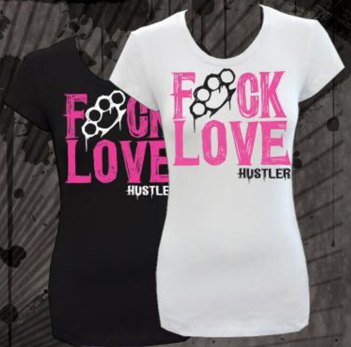
WR2144 F-LOVE WHITE, BLACK 95% COTTON 5% SPANDEX PRINTED TEE S-XL