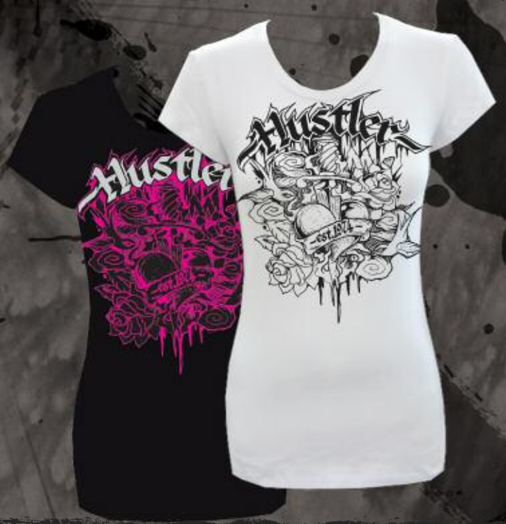
WR2123 HEARTLESS WHITE, BLACK 95% COTTON 5% SPANDEX PRINTED TEE S-XL