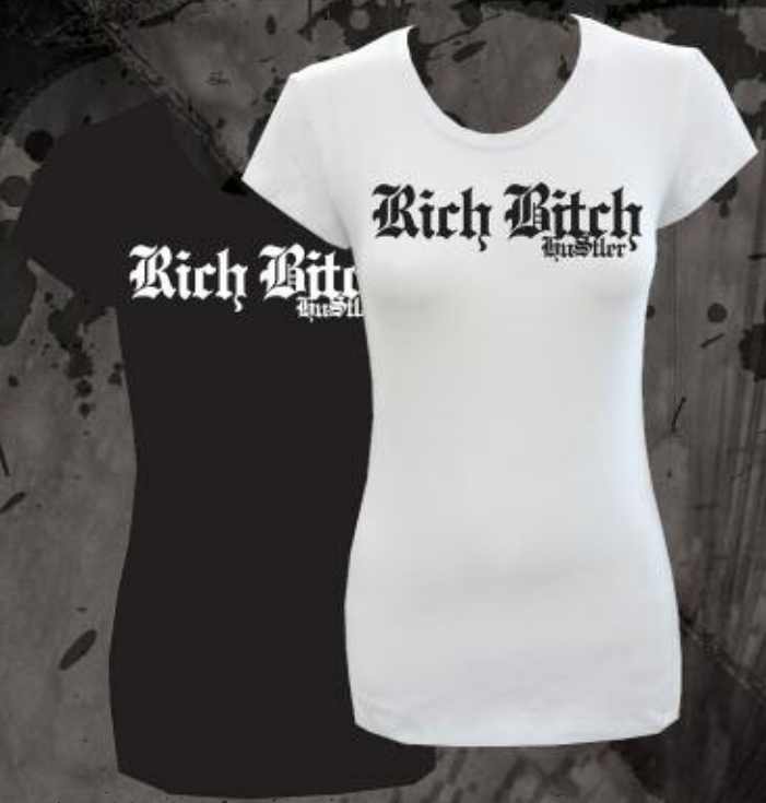
WR2130 RICH BITCH WHITE, BLACK 95% COTTON 5% SPANDEX PRINTED TEE RHINESTONE DETAIL S-XL