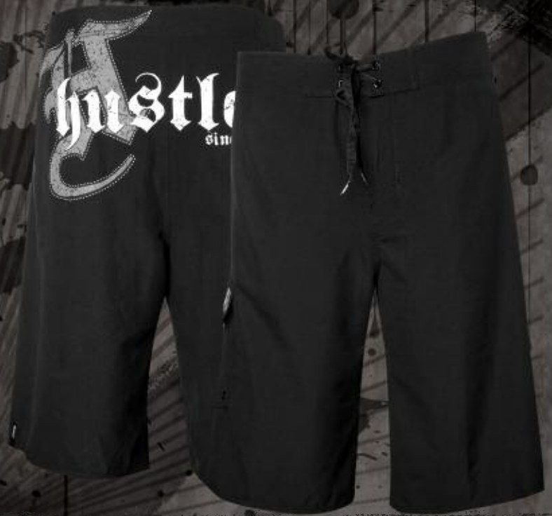
MS1012 SHADOW BLACK