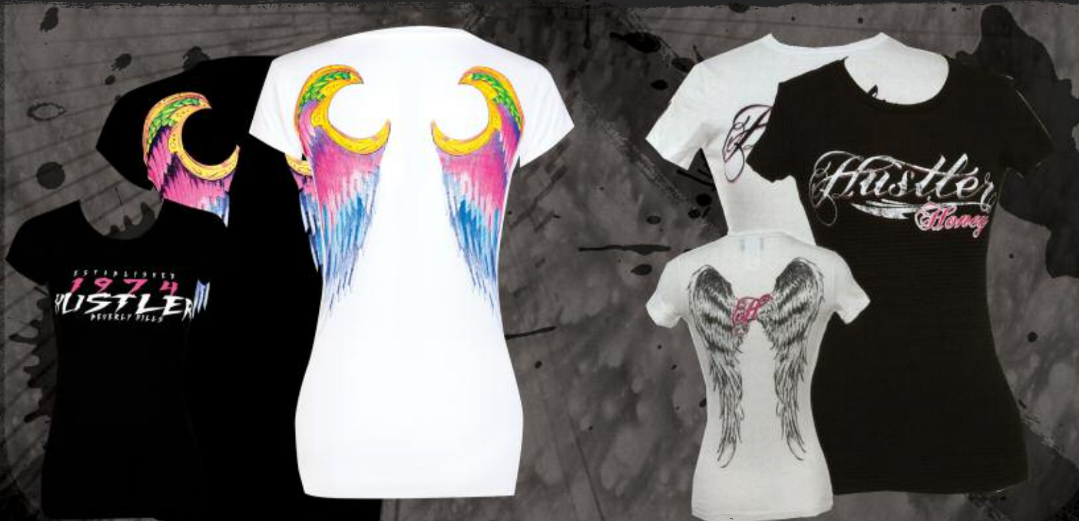
WR2104 HIGH BLACK, WHITE 100% COTTON PRINTED TEE S-XL