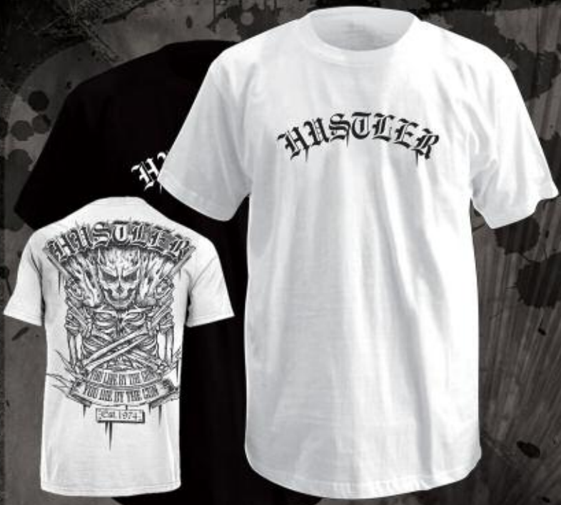
MR1259 GUNS DRAWN BLACK,WHITE 100% COTTON PRINTED TEE FRONT & BACK M-2XL