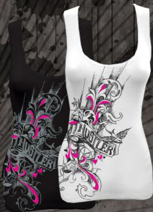
WT3073 SOUL FLY BLACK, WHITE 95% COTTON 5% SPANDEX PRINTED STRECH TANK S-XL