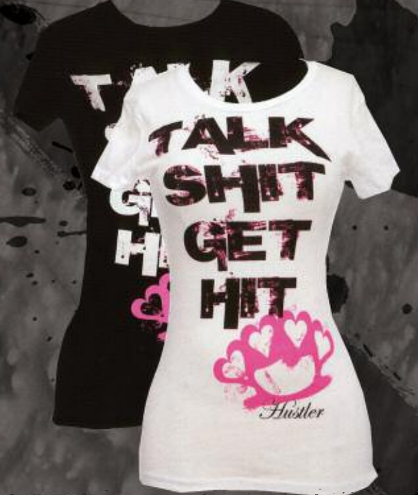
WR2071 KEEP TALKIN BLACK, WHITE 100% COTTON PRINTED TEE S-XL