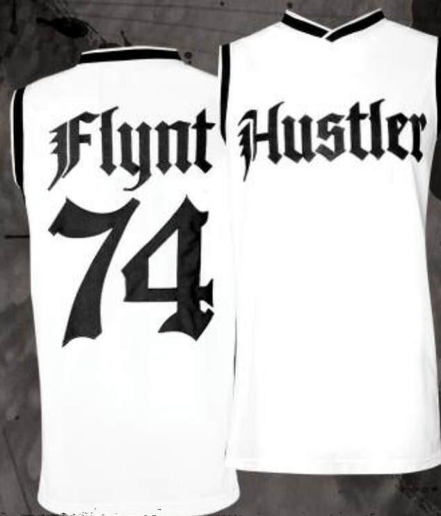
MP1003 CLASSIC JERSEY BLACK, WHITE 100% POLYESTER WHITE M-2XL