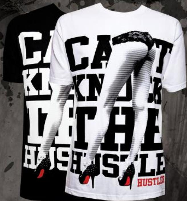
MR1219 THE HUSTLE BLACK, WHITE 100% COTTON PRINTED TEE M-2XL