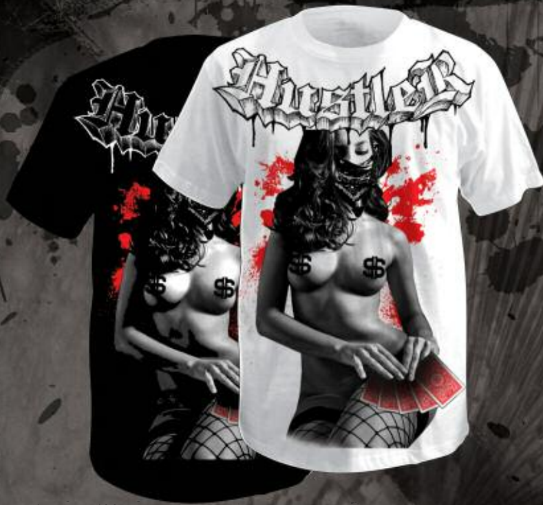
MR1273 CARDS WHITE, BLACK 100% COTTON PRINTED TEE M-2XL