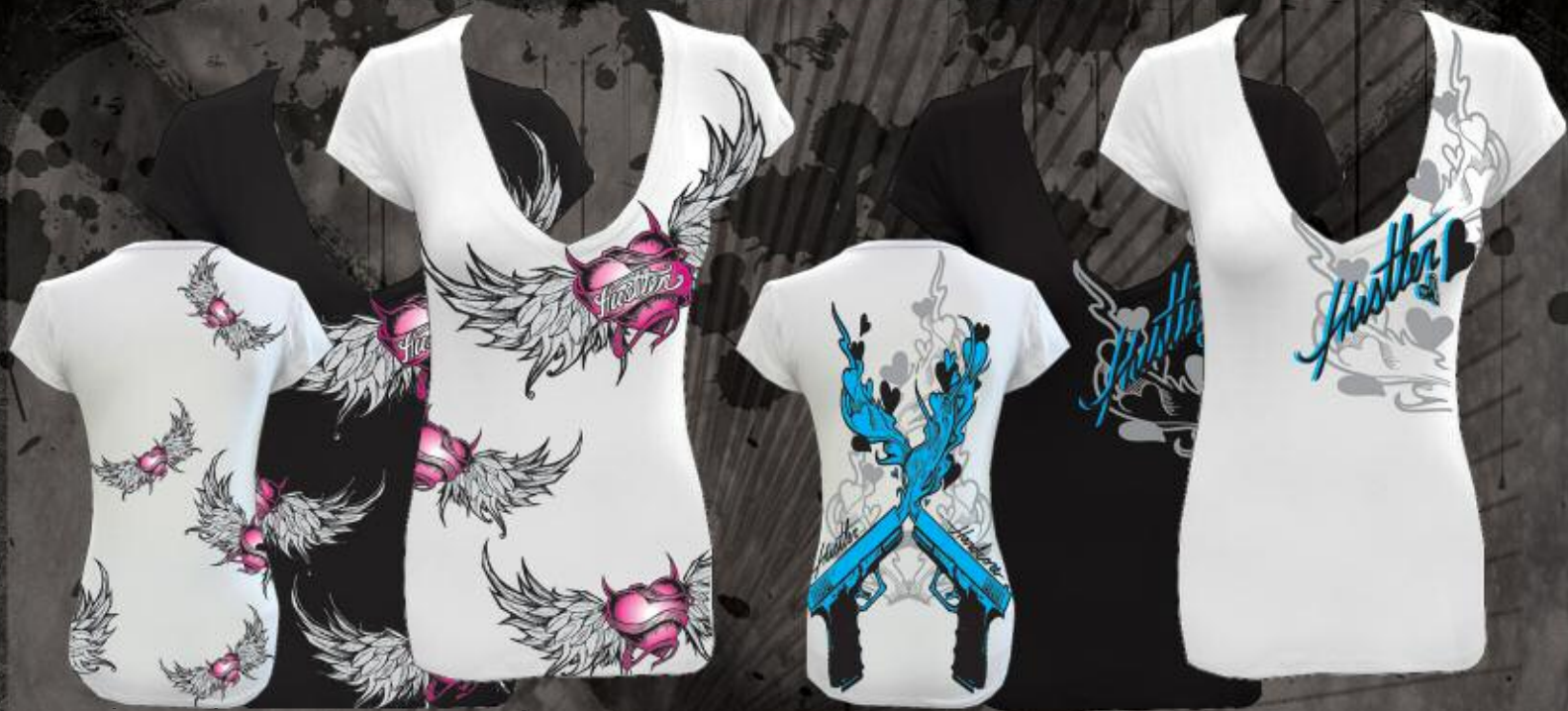
WR4029 BLACK ANGEL WHITE, BLACK 95% COTTON 5% SPANDEX PRINTED V-NECK FRONT AND BACK S-XL