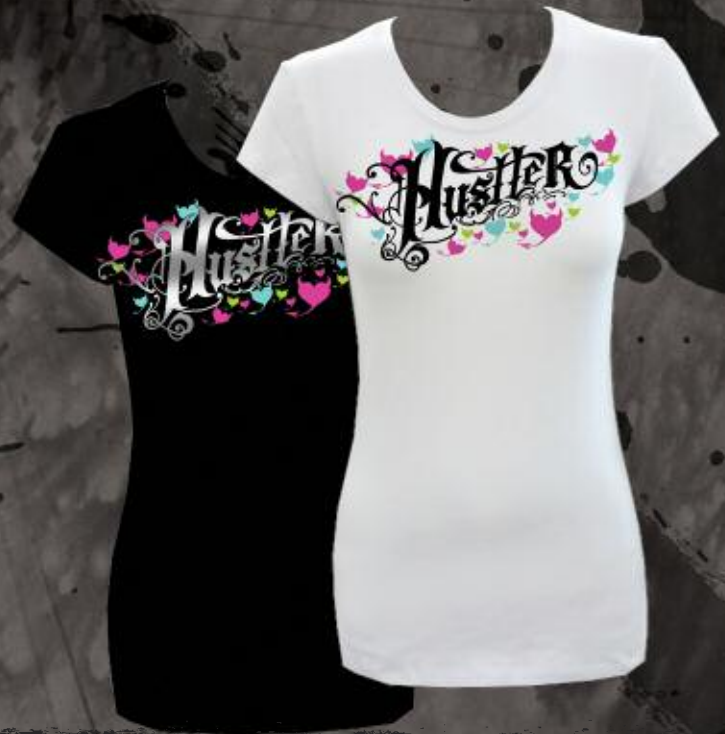
WR2119 DEVIL HEARTS WHITE, BLACK 95% COTTON 5% SPANDEX PRINTED TEE WITH LIQUID SILVER S-XL