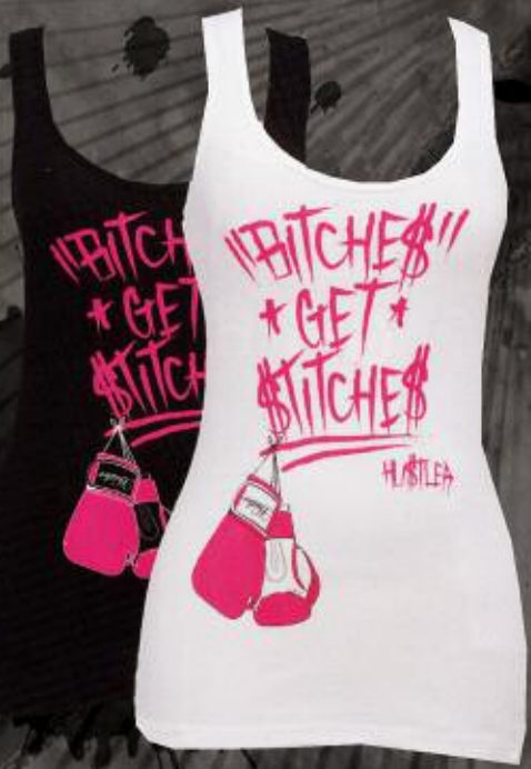
WT3036 STITCHES BLACK, WHITE 100% COTTON PRINTED RIBBED TANK S-XL