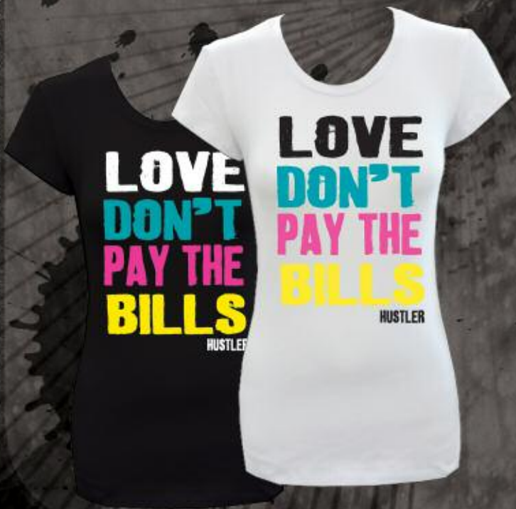
WR2142 LOVE DON'T PAY WHITE, BLACK 95% COTTON 5% SPANDEX PRINTED TEE S-XL