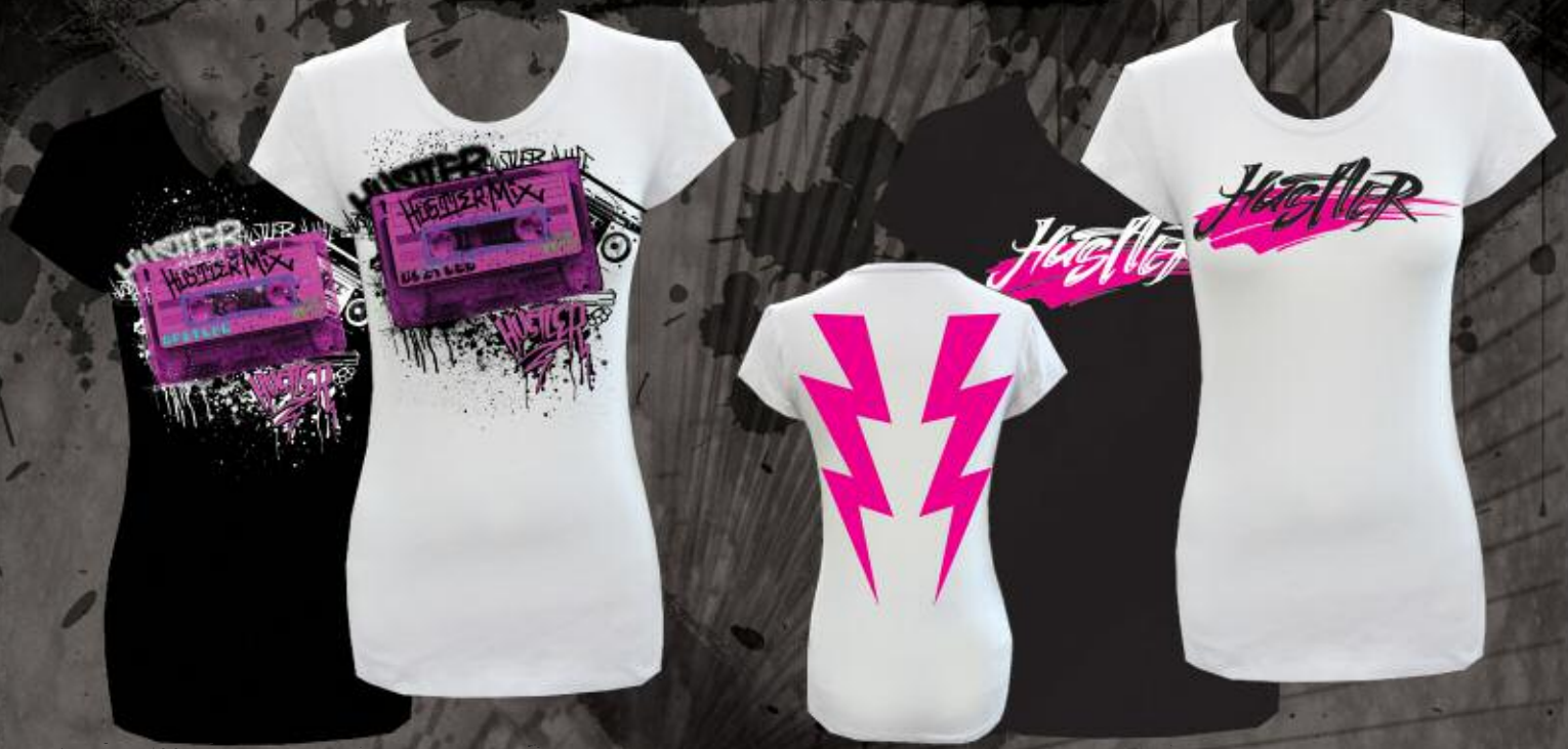
WR2163 CASETERO WHITE, BLACK 95% COTTON 5% SPANDEX PRINTED TEE S-XL