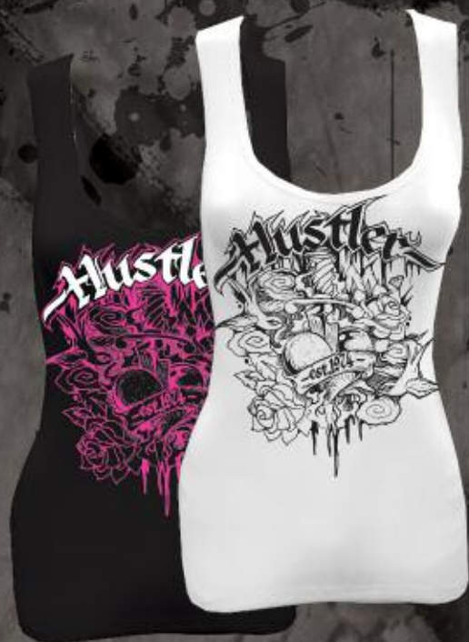
WT3081 HEARTLESS BLACK, WHITE 95% COTTON 5% SPANDEX PRINTED STRECH TANK S-XL