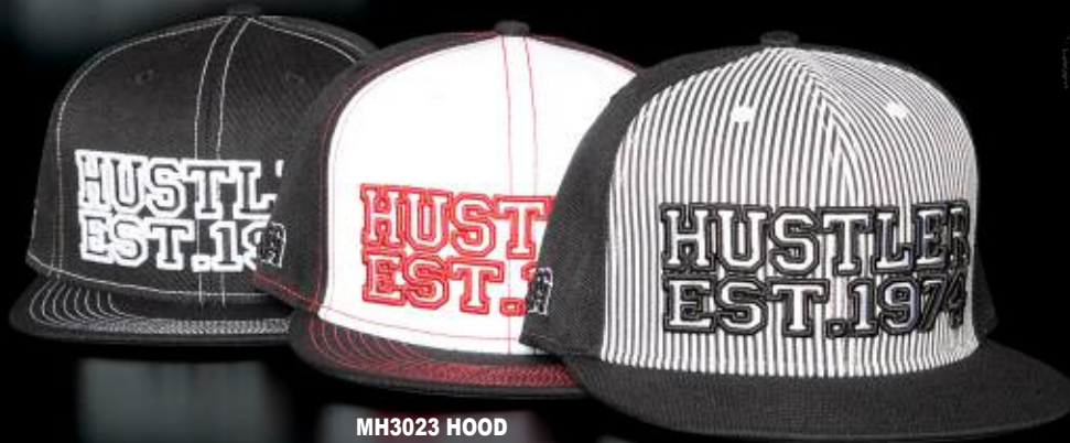
MH3023 HOOD BLACK, BLACK/WHITE, BLACK/RED 3D EMBROIDERED FLAT BILLED HAT WITH CONTRAST STITCHING INSIDE STITCHING S,M,L