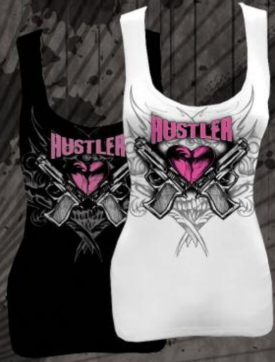
WT3074 BROKEN PROMISE BLACK, WHITE 95% COTTON 5% SPANDEX PRINTED STRECH TANK S-XL