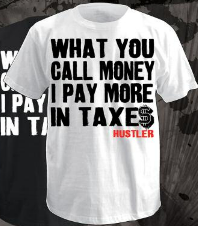
MR1283 TAXES WHITE, BLACK 100% COTTON PRINTED TEE M-2XL