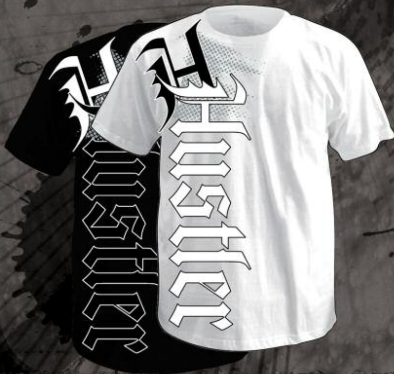
MR1284 CRUSH WHITE, BLACK 100% COTTON PRINTED TEE M-2XL