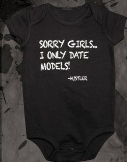
BR1009 ONLY MODELS BLACK 100% COTTON SIZES 0-6, 6-12, 12-24