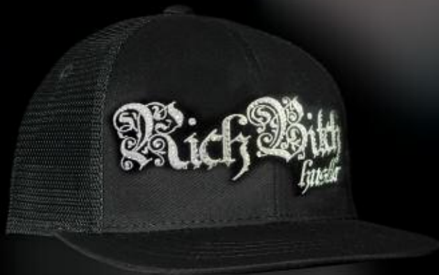
WH4010 RICH BITCH TRUCKER BLACK ADJUSTABLE BACK TRUCKER