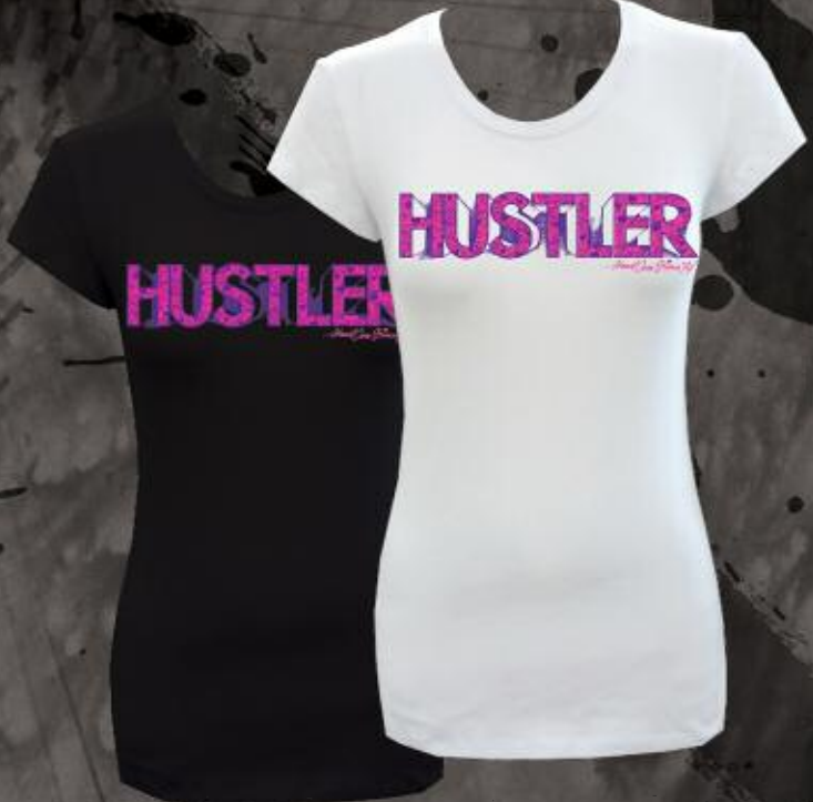
WR2143 RATED-R WHITE, BLACK 95% COTTON 5% SPANDEX PRINTED TEE S-XL