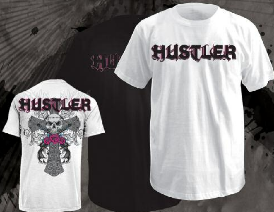
MR5027 CROSSER FLYNT WHITE, BLACK-100% COTTON PRINTED TEE WITH FLOCKING FRONT AND BACK M-2XL