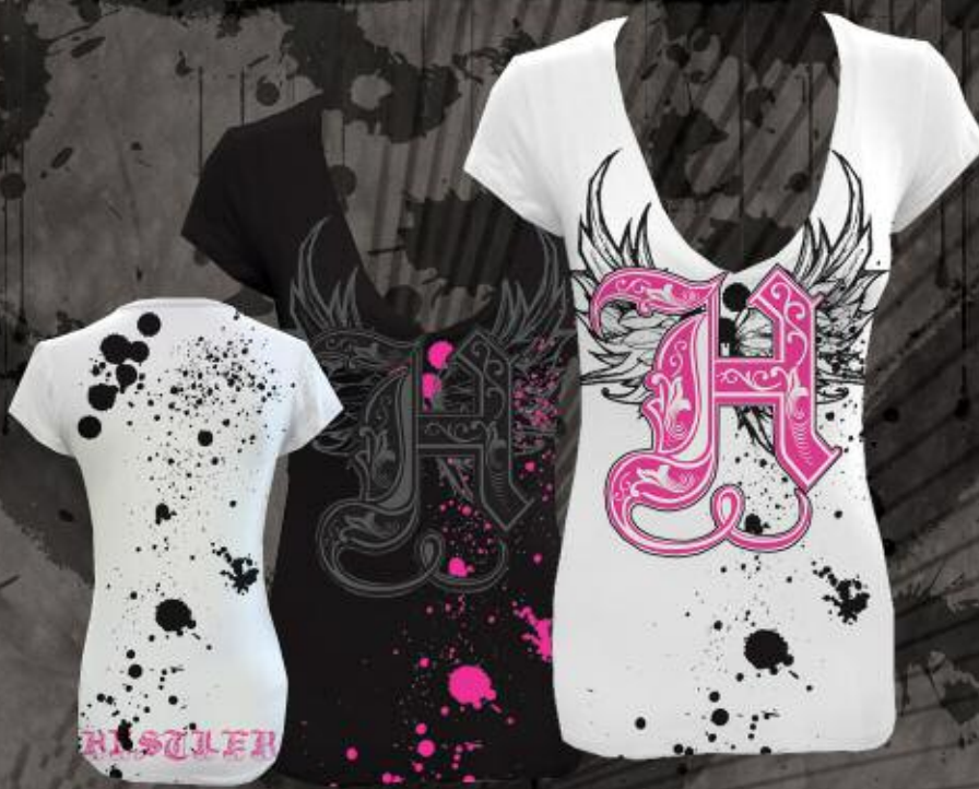
WR4023 HOT WINGS BLACK, WHITE 95% COTTON 5% SPANDEX PRINTED V-NECK FRONT & BACK S-XL