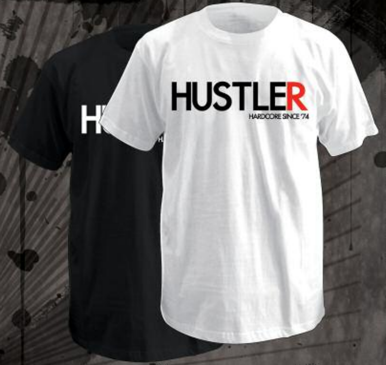
MR3027 RATED-R SLIM WHITE, BLACK 100% COTTON PRINTED SLIM FIT TEE M-2XL