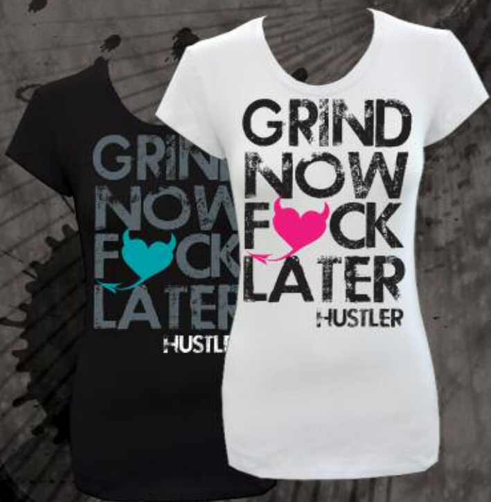
WR2136 GRIND WHITE, BLACK 95% COTTON 5% SPANDEX PRINTED TEE S-XL