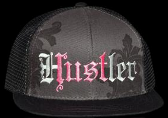
WH4007 LUST TRUCKER BLACK ADJUSTABLE BACK TRUCKER SCREEN PRINT & EMBROIDERY